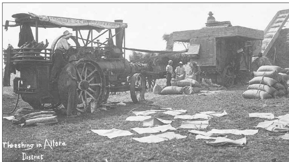
A traction engine driving a wheat thresher in the Allora district.