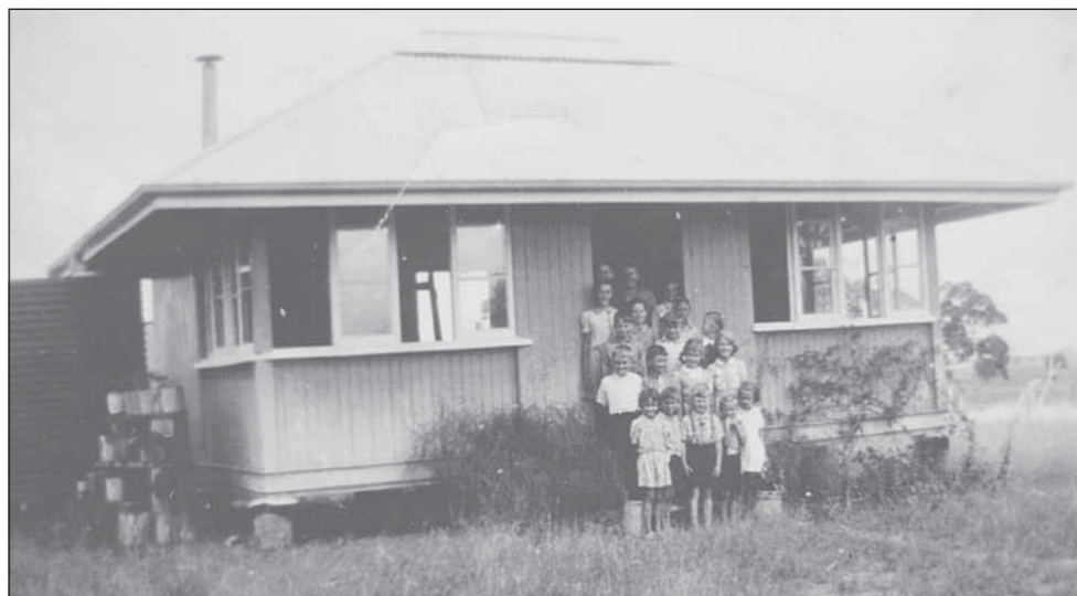
The Talgai West School in 1942.

The following letter from the Under-Secretary, Department of Public