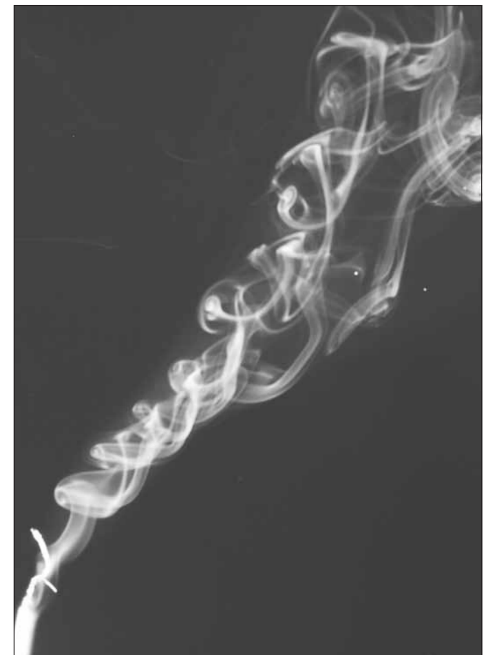
A modest attempt at "Smoke Trail" photography.