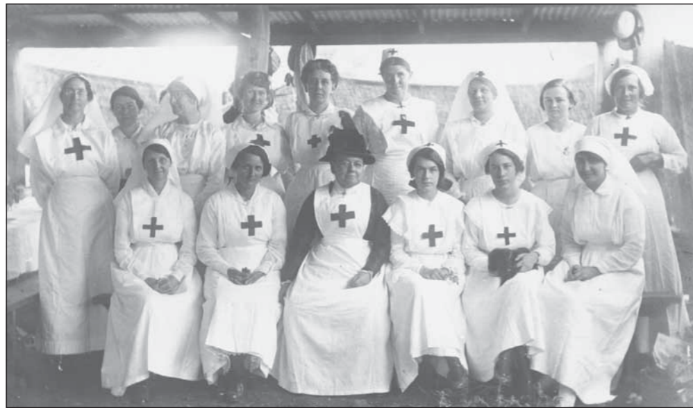
The ladies of the Allora Red Cross taken in 1917. From the Weber album.