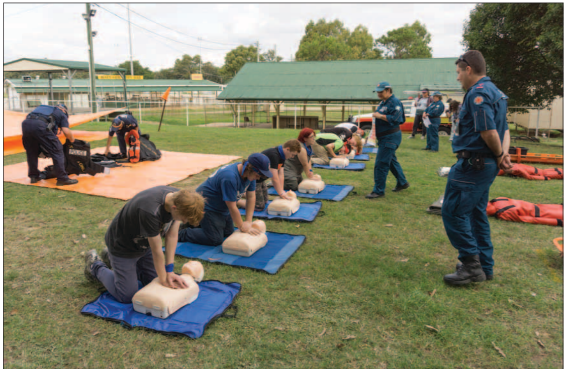
Wolves and Meteors race QAS CPR.