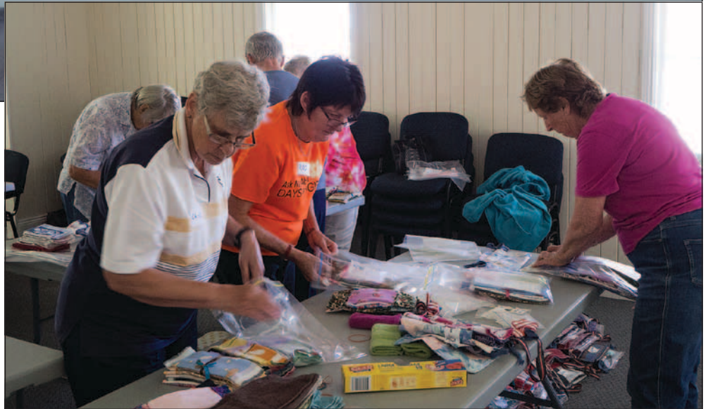
Action on the packing day for Days For Girls packages.

On Thursday, 16th April, the Allora Days For Girls group packed two hundred kits which will be sent to Nepal next month along with four hundred Days For Girls kits from Toowoomba. Thank you to all sewers, packers, supporters, community groups and the wonderful people who have contributed so generously in so many different ways.