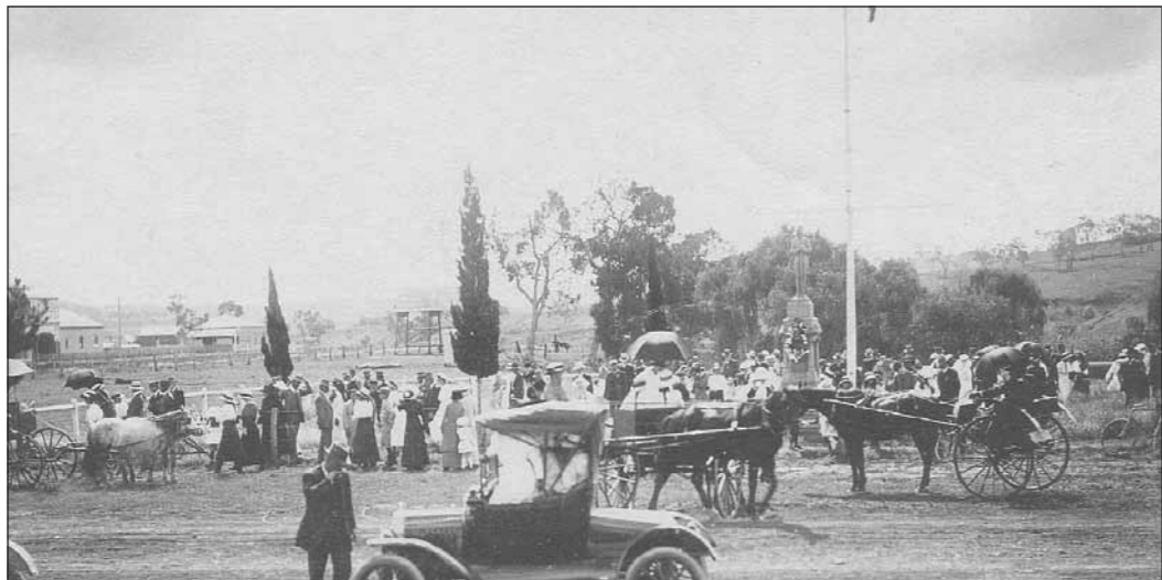
A photo taken on Anzac Day C.1920 (Note absence of WW I memorial built 1921).