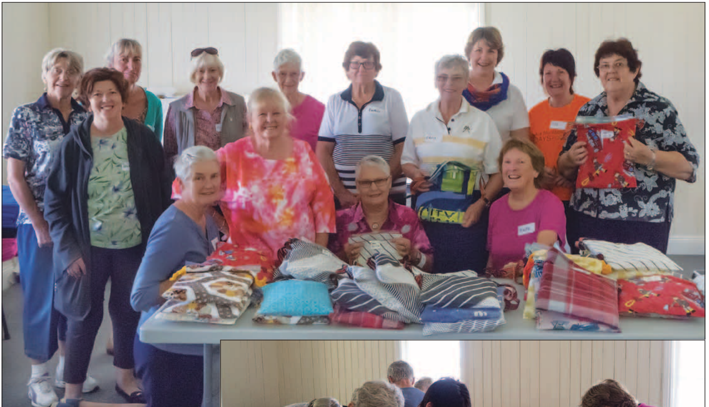
ABOVE: Allora's Days For Girls volunteers.