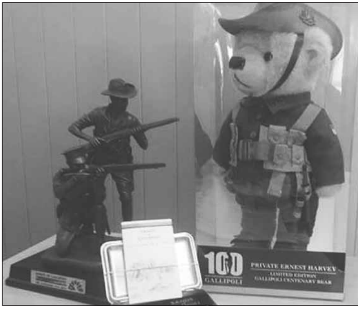
Prizes for the Allora Advertiser's Anzac Day competition in celebration of the 100th Anniversary of Gallipoli.

In order to commemorate the 100th Anniversary of Gallipoli, Allora Advertiser is currently running a #DiggersTribute competition on Facebook to win an Anzac Day prize package. The package valued at $250 includes a collectible teddy bear, an iconic Anzac figurine and a burnished commemorative medallion from The Military Shop's "Australia in the Great War" collection. Come in and see them on display in our office at 53 Herbert Street, Allora. Anyone from Allora and the surrounding area can enter. Entry is FREE. All you need to do is take a photo of yourself with something that honours Anzacs (e.g. at the war monuments around town or with someone who is serving or has served in the Australian or New Zealand armed forces - even a photo of yourself with personal objects or letters which have significance to the Anzacs), then post your photo with the hast tag #diggertribute to the Allora Advertiser's Facebook page at - www.facebook.com/alloraadvertiser - to enter the draw or alternatively, if you have no Facebook or internet access, bring in your photo to us and we will upload it for you. The winner will be drawn Friday, 1st May 2015, and published in The Allora Advertiser, Thursday, 7th May 2015.