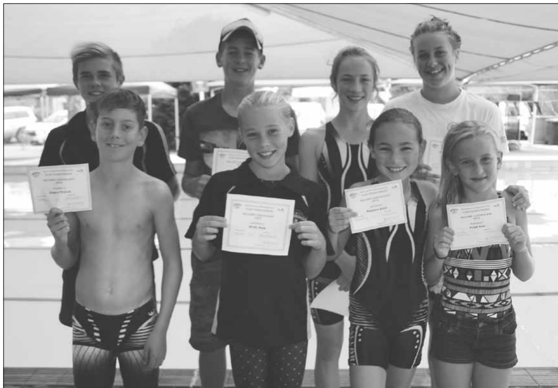
Club Championships Record Breakers

In keeping with Qld Swimming rules, a non-competitive event was held for all under 8 swimmers who were awarded a participation trophy for their efforts. Under 8 swimmers were