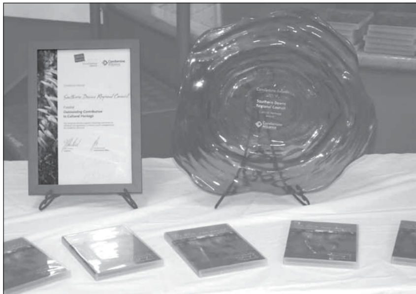
Condamine Awards: Cultural Heritage Category

"The interviews were with residents affected by the floods, service providers, community volunteers, emergency responders and community leaders.