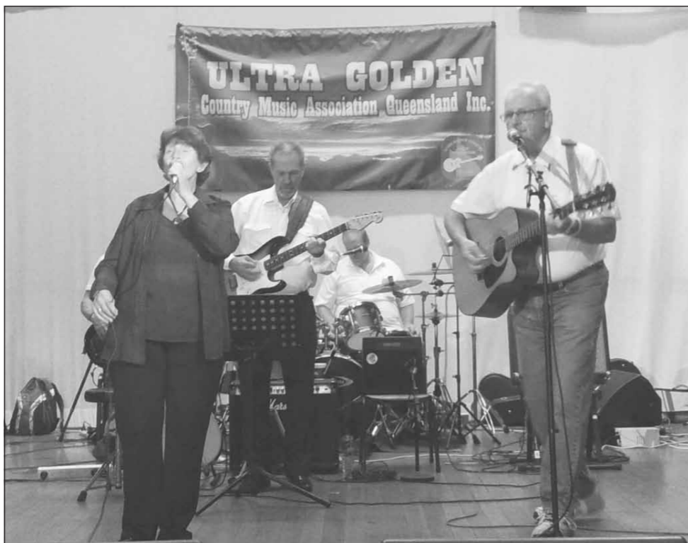
Ultra Golden Country Music Concert is coming to Allora State School on Sunday, 29th March.