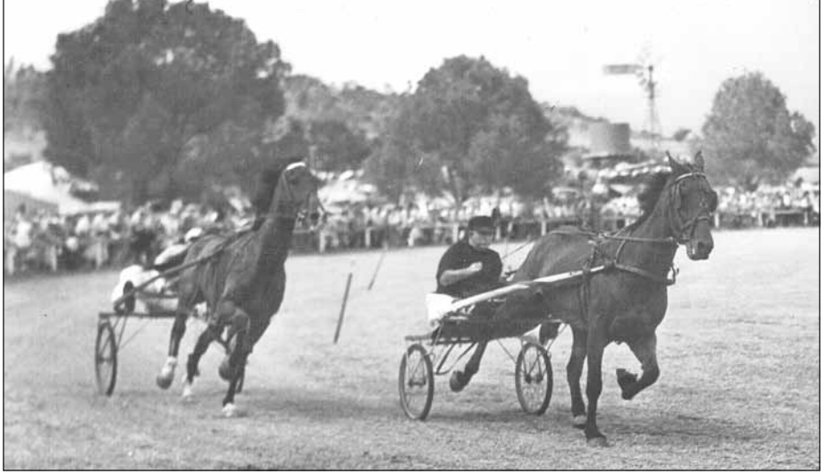
Trotting at the 1956 Allora Show

The death occurred at the Allora Presbytery of the Venerable Archdeacon