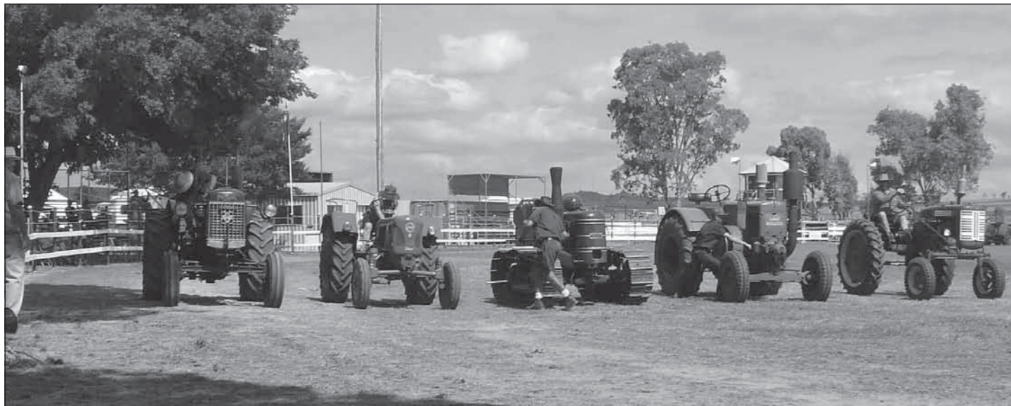
"Start your engines" ...and they're off in the tractor race that brought a close to an amazingly successful 2014 Allora Heritage Weekend.