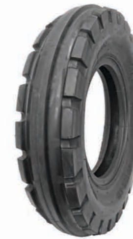
Harvest 600-16 Traditional BTR 750-16 Traditional BTR