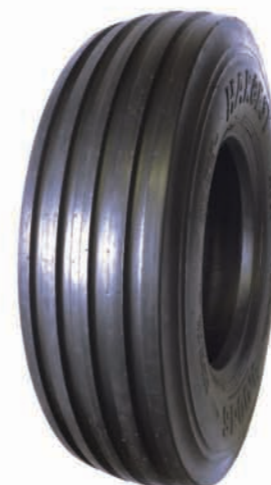
Harvest 900-16 Traditional 5 Rib Multi 1100-16 Traditional 5 Rib Multi