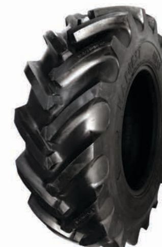
Harvest Traditonal 45 Degree Lug Angle

SPECIAL PRICES - CASH AND CARRY THIS WEEKEND FOR ALLORA HERITAGE WEEKEND