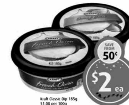
Kraft Classic Dip 185g $1.08 per 100g