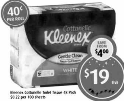
Kleenex Cottonelle Toilet Tissue 48 Pack 50.22 per 100 sheets