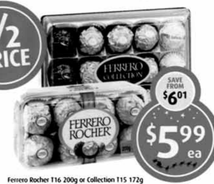
Ferrero Rocher T16 200g or Collection T15 172g