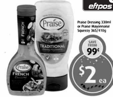
Praise Dressing 330ml or Praise Mayonaisse Squeezy 365/410g