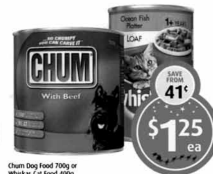
Chum Dog Food 700g or Whiskas Cat Food 400g