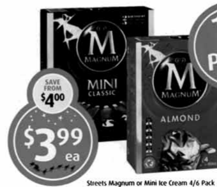
Streets Magnum or Mini Ice Cream 4/6 Pack