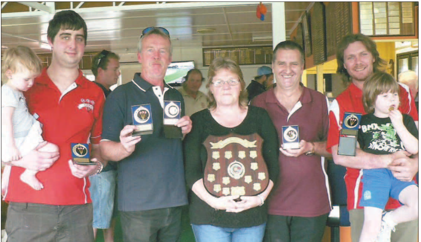
The Allora Darts Club A Grade Team at Allora Sports Club.