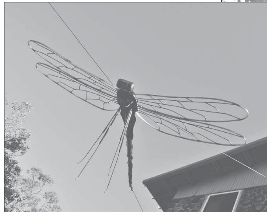
BELOW: Some of the Group's members thanking their hosts