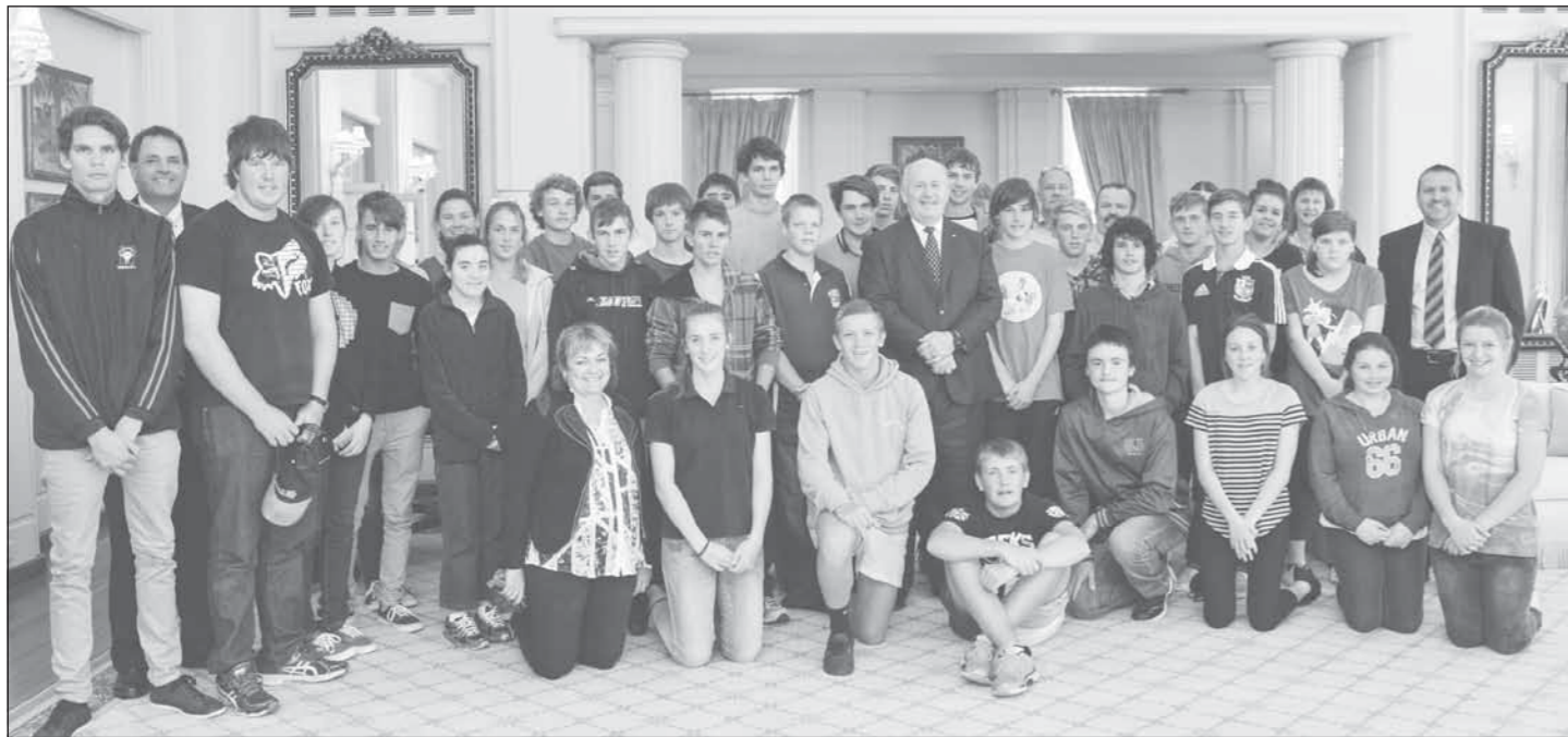
Allora and Killarney Year 10 students with the Governor General, Sir Peter Cosgrove in Canberra