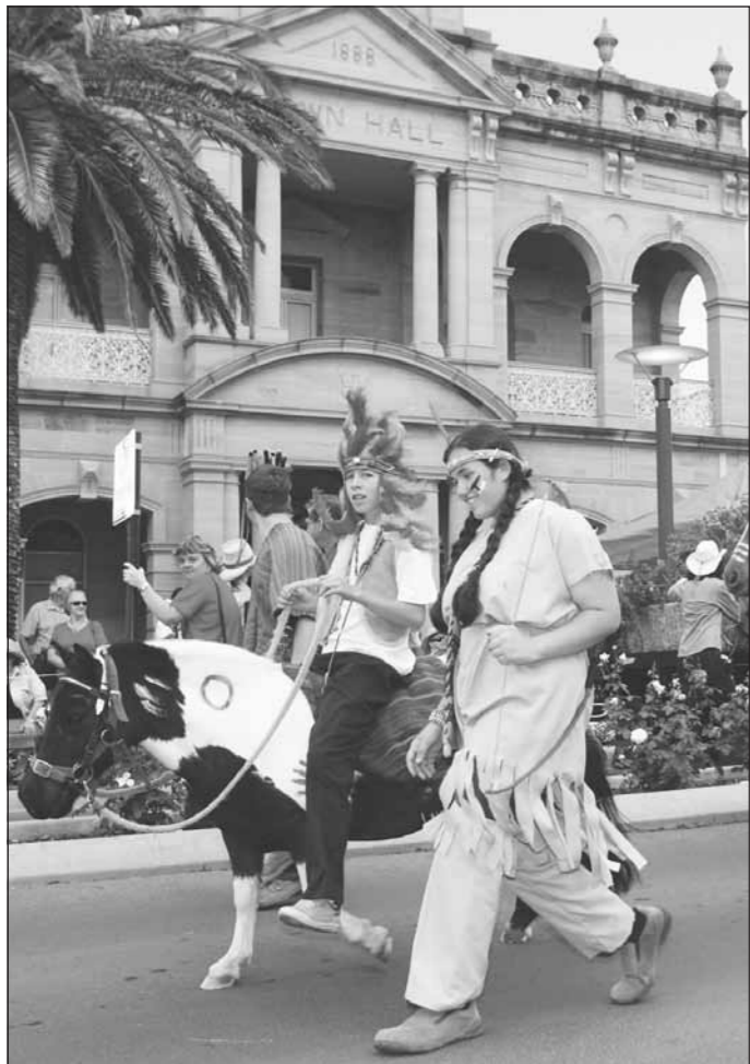
10 — THE ALLORA ADVERTISER ... THURSDAY, 23rd OCTOBER 2014