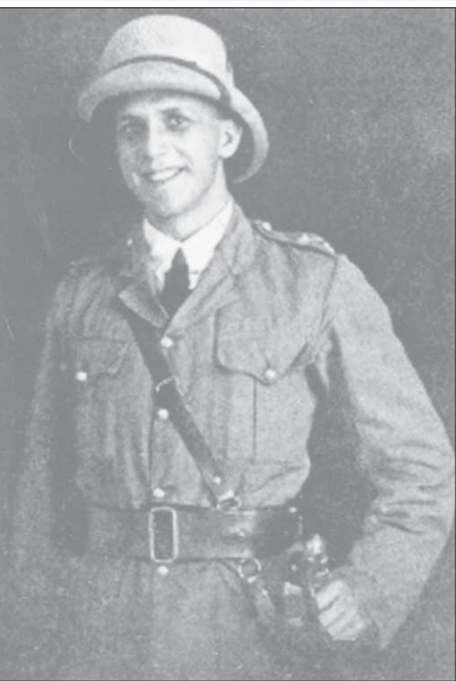
Lieutenant Victor Sampson, First New Guinea Expeditionary Force, September 1914.

For further updates on the road closure go to the 131940 Traffic and Travel Information website which is www.131940.qld.gov.au . Anyone with questions on the detours please contact Council on 1300 MY SDRC (1300 697 372).