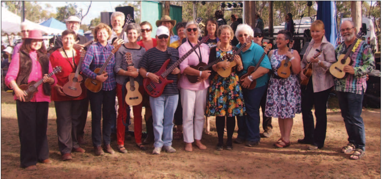
Members of the Stanthorpe and Warwick uke groups, affectionately known as the 'WUPPIES' (Warwick) and the 'UPPERS' (Stanthorpe), seen here following a performance at the recently held Bony Mountain Folk Festival.