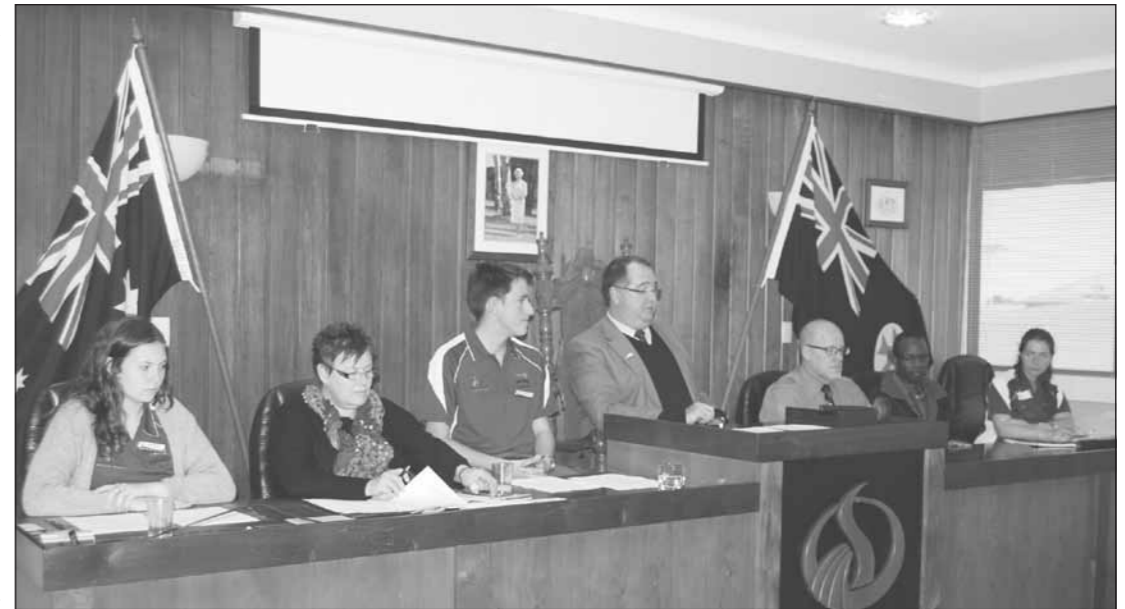
Young Leaders running a Council meeting - this is one the numerous activities that Young Leaders can become involved in. Council is encouraging local young people to apply for next year's program.