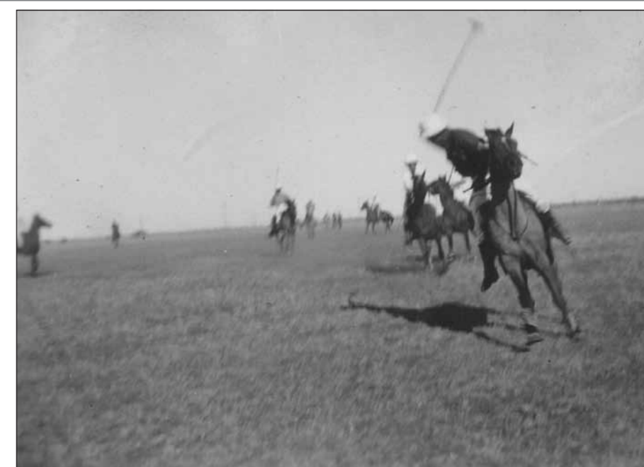
Allan Gilmore playing polo, Dwyer's paddock, Spring Creek, in the early 1940's.

They were arrested following a high speed chase along the Warwick-Allora main road. Witness, Constable McKay of the Warwick Police, testified that about 11.30 p.m. on October 10th, he was patrolling the Warwick-Allora road when he saw a motor car approaching. Another officer signalled it to stop, but it accelerated. For about three miles the