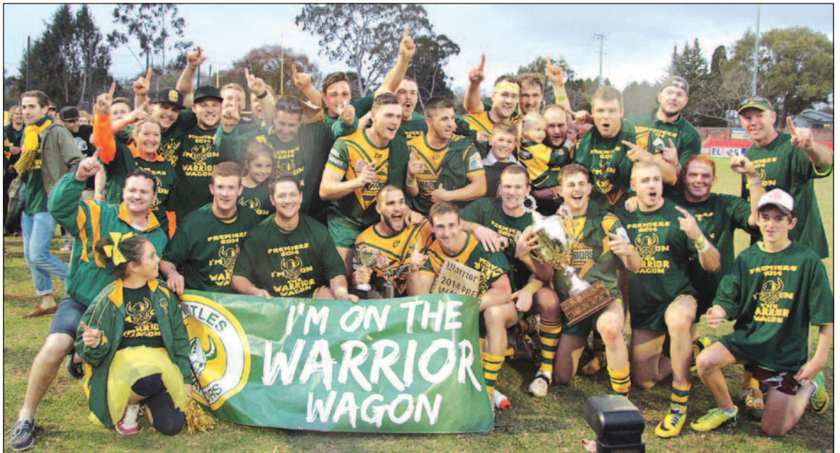
The Wattles 'Warriors' A Grade team with staff & supporters after winning the 2014 'Hutchinson's Builders' Toowoomba Rugby League premiership at Clive Berghofer Stadium for the first time in seventeen years.

And so ends another chapter in Wattles history, the club soon