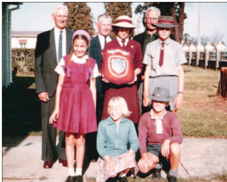
1964 Gwynne Family Shield. More 1964 Allora State School photos inside...