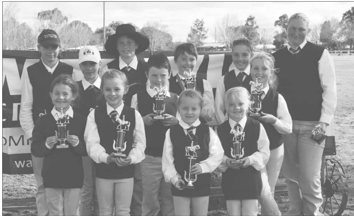
Allora Pony Club members attended the campdraft and gymkhana over the weekend.