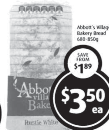
Abbott's Village Bakery Bread 680-850g