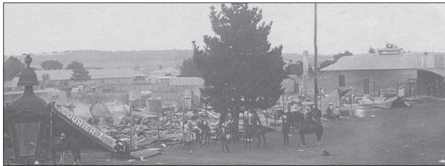
After the 1909 fire on the corner of Herbert and Drayton Streets. The scene would have been similar following the 1914 fire.

The Queensland Country Life 3rd August 1939