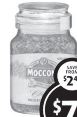
Moccona Freeze Dry 100g or Flavour Infused Coffee 95g Selected Varieties