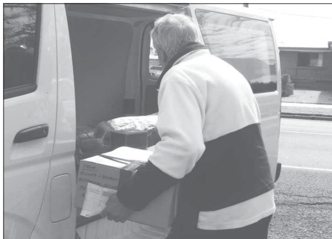
A box load of rare Allora newspapers is loaded onto the courier for delivery to the State Library of Queensland.

www.new-england-hway.com.au/roseneath.htm