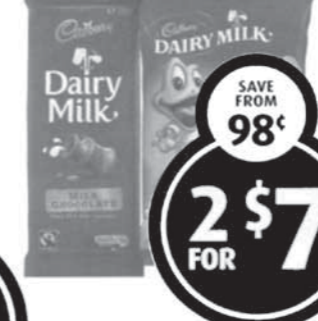
Cadbury Chocolate Block 155-220g or Sharepacks 168-240g or Green & Black Chocolate Block 100g Selected Varieties Single $3.80 each