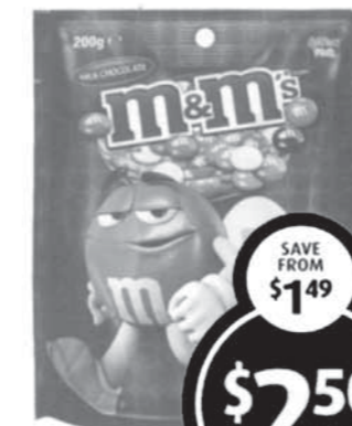
M&M's, Maltersers or Pods 155-200g

www.facebook.com/foodworksaus Like us on Facebook for great specials and free giveaways — Find us on Facebook under 'Allora FoodWorks'