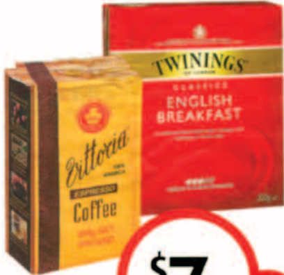
Twinings Specialty Tea Bags 100 Pack or Vittoria Espresso Coffee Beans or Ground 200g

SPECIALS AVAILABLE 13/08/2014 to 19/08/2014