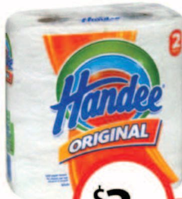
Handee Ultra Paper Towel 2 Pack or Double Length 1 Pack $2.50 per 100 sheets