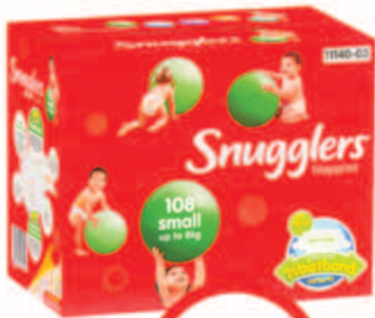
Snugglers Bulk Nappies 60-108 Pack Selected Varieties