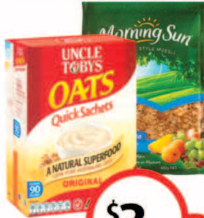
Morning Sun Muesli 650g or Uncle Tobys Oats Quick Sachets Original 340g