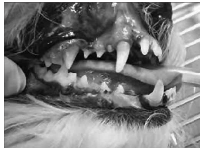
Has your best made had his free dental checkup at Allora Vet Clinic?

Feeding a dry food rather than moist canned food will help remove bacterial plaque. A dry food formula, like Hills T/d formula can provide adequate chewing exercise and stimulation of the gum which can lead to a healthy mouth and less gum disease. It's like a tooth brush in your pet's food! Dr Dowsett added. If tartar is present we can descale the dog or cats teeth