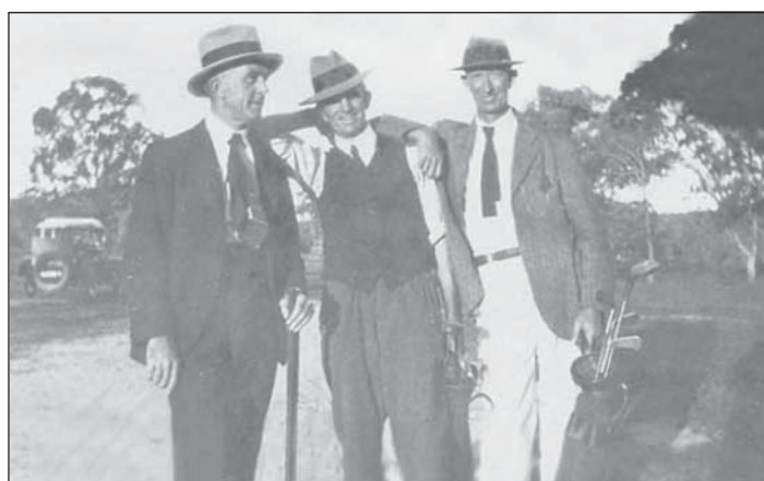
Three Allora characters on the golf course at Hendon in the 1930's.