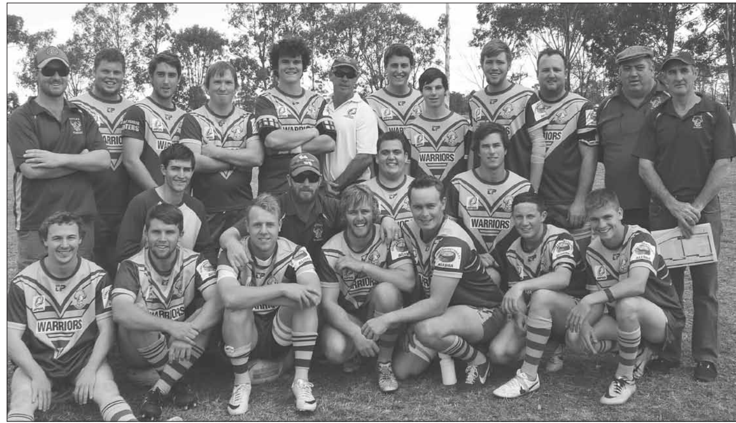
Wattles 'Railway Hotel, Allora' reserve grade team before they took on Dalby at Millmerran on Sunday.

Answers in Classifieds pages Originally published in Science by Email. For more CSIRO Double Helix science visit www.csiro.au/helix or call 02 6276 6643.