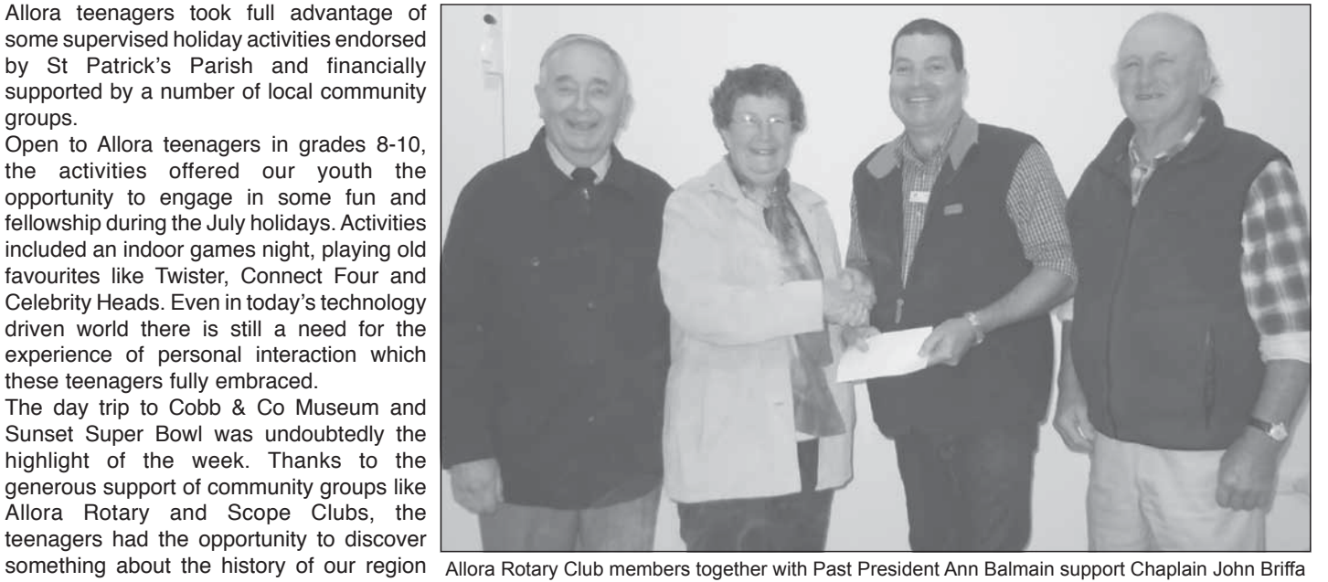
with funding to cover the cost of the coach hire for some Youth Holiday Activities.

A movie night and sausage sizzle capped off the week with the St Patrick's Parish Function Room transformed into a make shift theatre complete with a big screen and some big speakers to enhance the movie magic. All three days of the youth activities were sponsored by the Allora Rotary and Scope Clubs in collaboration with St Patrick's Parish and the Allora Chaplaincy Committee.