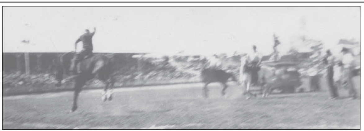
Hugh Byrne riding buckjumper at the Warwick Rodeo in the early 1940's.