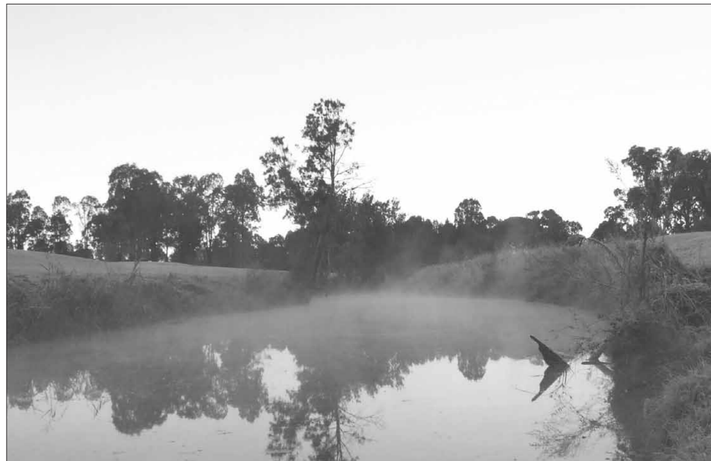
Allora's Dalrymple Creek looking well at home for the upcoming 'Allora Winter festival' in July.