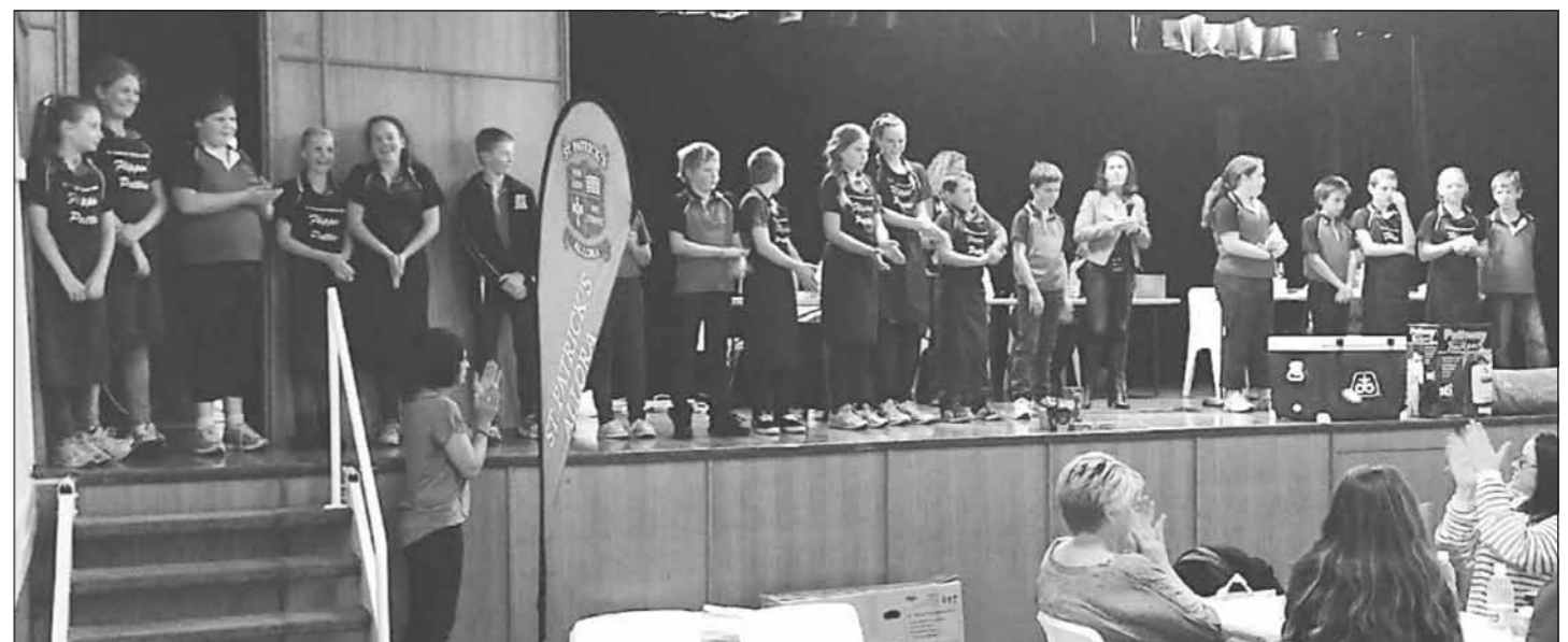
The crowd acknowledged the help of the 2014 School Leaders for their assistance on the night