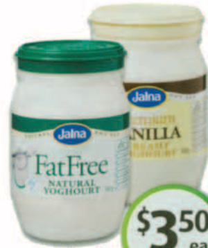
Jalna Yoghurt 500g Selected Varieties $0.70 per 100g