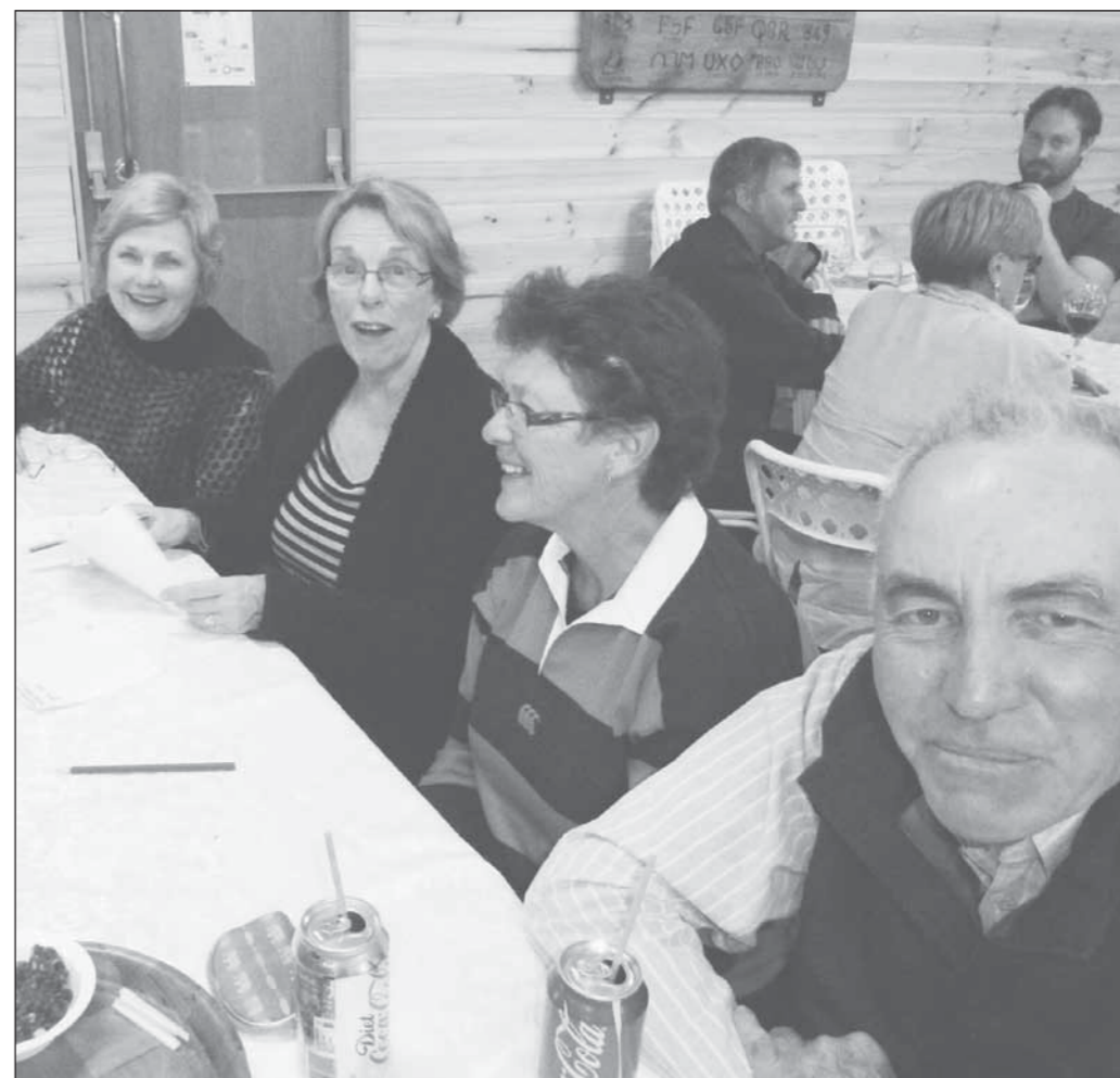
Trivia buffs having a great time at the May Goomburra Trivia Night.