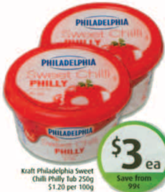
Kraft Philadelphia Sweet Chili Philly Tub 250g $1.20 per 100g

SPECIALS AVAILABLE 04/06/2014 to 10/06/2014