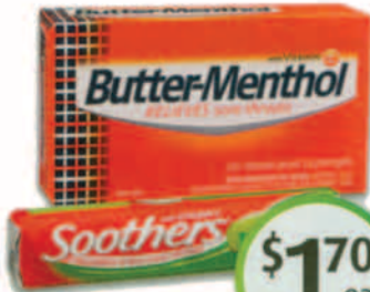
Allens Medicated Throat Lozenges 10-23 Pack Selected Varieties