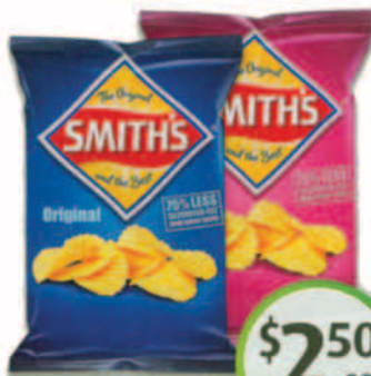
Smith's Chips 175g Selected Varieties $1.43 per 100g