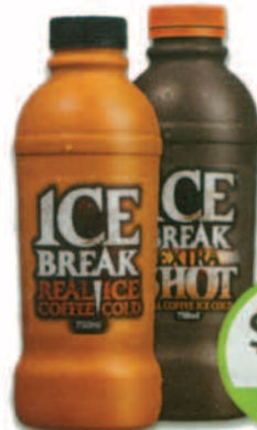
Ice Break or Extra Shot Milk 750ml $4.00 per litre