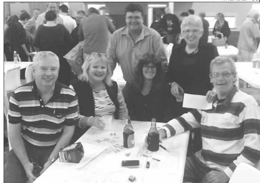
"No Idea At All" winning team

Our upcoming meeting, Wednesday 11th June, features Pets as our subject. Last month we were very happy to welcome several newcomers, and there's always a big welcome for others to act upon their curiosity and come along! We enjoy lots of learning and laughs: 7pm State School.