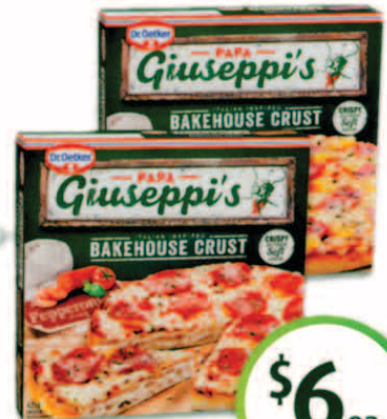
Dr. Oetker Papa Giuseppe's Bakehouse Crust Pizza 425g-465g