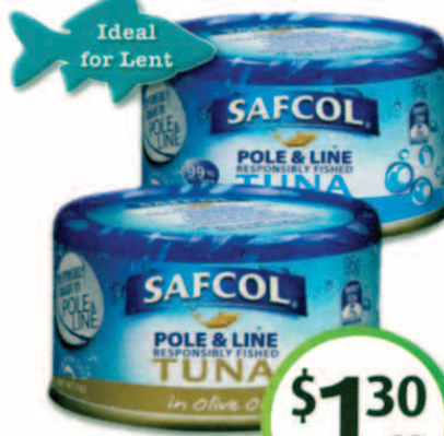
Safcol Responsibly Fished Tuna 95g selected varieties