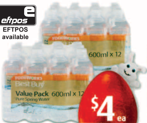
FoodWorks Best Buy Spring Water 12pk x 600mL