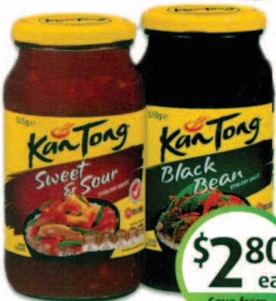
Kantong Sauce 485g-520g