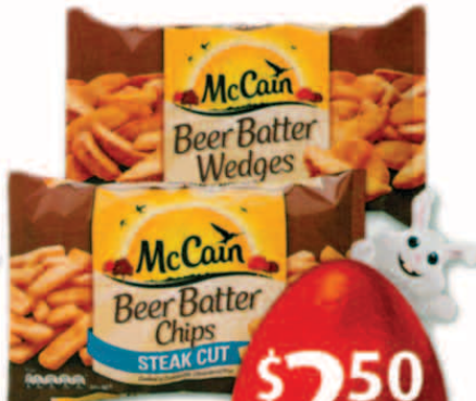
McCain Beer Batter or Crunchy Chips, Wedges or Fries 750g selected varieties