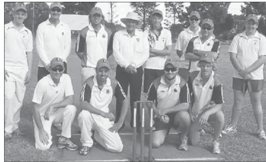
The Allora Cricket club side that defeated the Allora Invitational Cavaliers in the last Glen McGrath Foundation Pink Stumps Day at Allora Cricket Oval.

Wattles hold monthly meetings on the 2nd Tuesday of each month alternating between the Clifton Arms Hotel and the Allora Railway Hotel from 7.30pm each time.