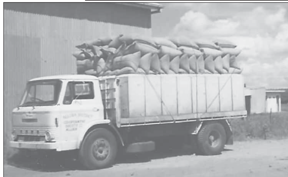
The D Series Ford Graeme drove for Allora Co-op, loaded with bags of sunflower seed ready to head to Brisbane in 1975.

He cut his teeth behind the wheel of a truck in a 1948 Ford at the Allora Co-op, where he also loaded semi-trailers to do runs