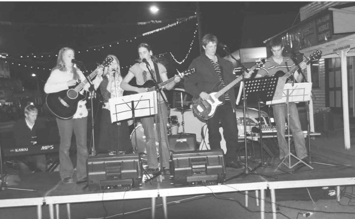
Local band Eaglez Wingz entertained at the recent Allora Rotary Bush Christmas Street Party on Friday, 6th December.