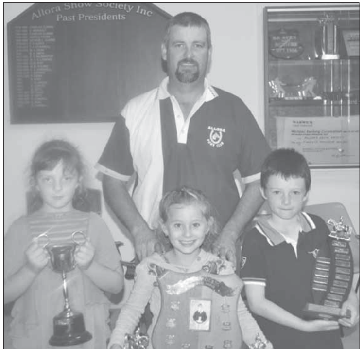
Allora Pony Club trophy winners.