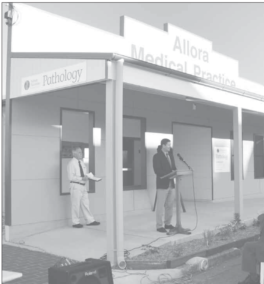
TOP: Colin Hahn unveils commemoration plaque for new Allora Medical Practice.