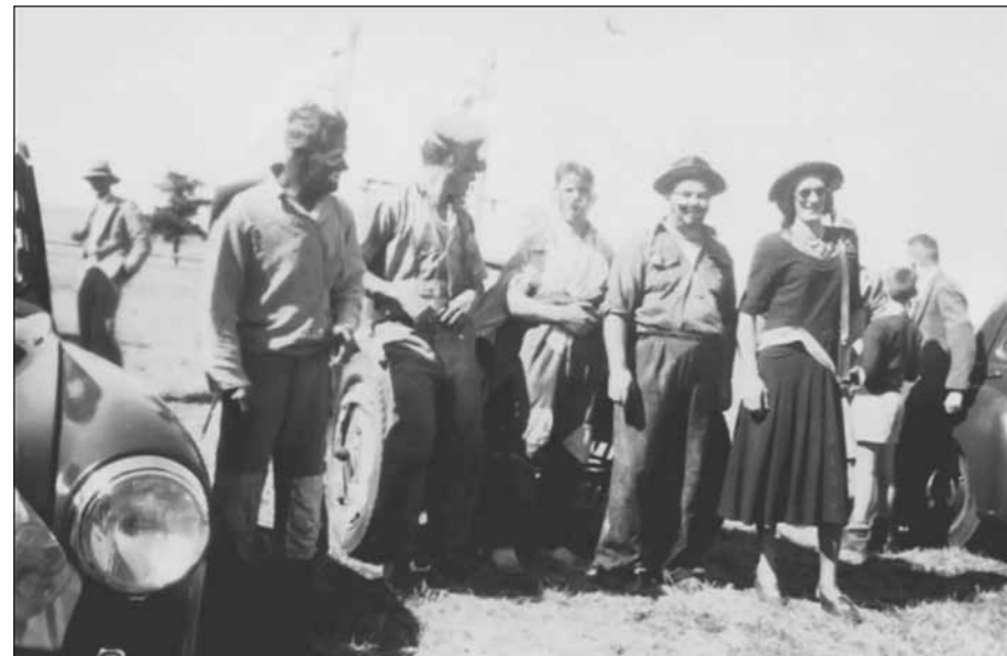
Some of Allora Motors male staff c. 1959.