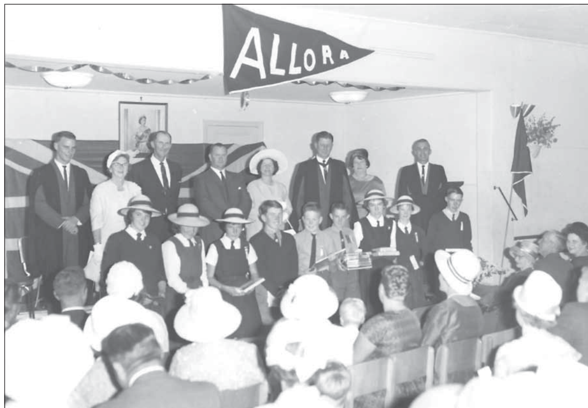
The Allora State School initial Speech Day at the Allora RSL Hall, 1964.

A highlight of the evening will be the unveiling of two honour boards, listing the Allora State School Dux and also the Sportsperson of the Year, both boards commencing in 1964.