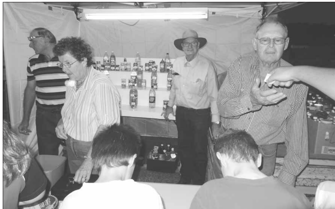
LEFT: The Bottle Stall proved to be as popular as ever again this year.

You and me together can help more than 1 million Aussies this year.