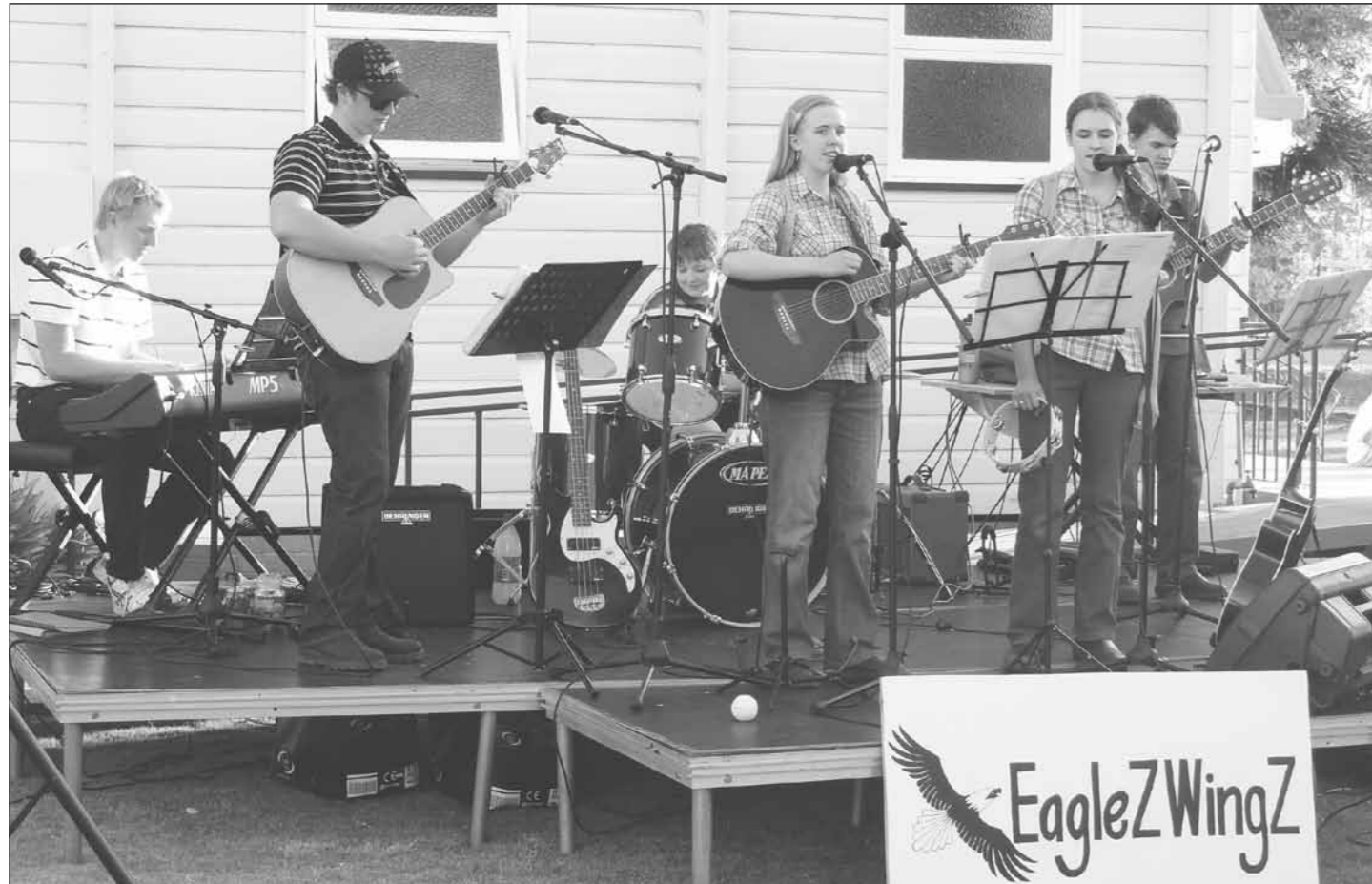
ABOVE: Youth band EagleZ WingZ entertained the crowd at the Anglican Parish annual Fete on Friday.