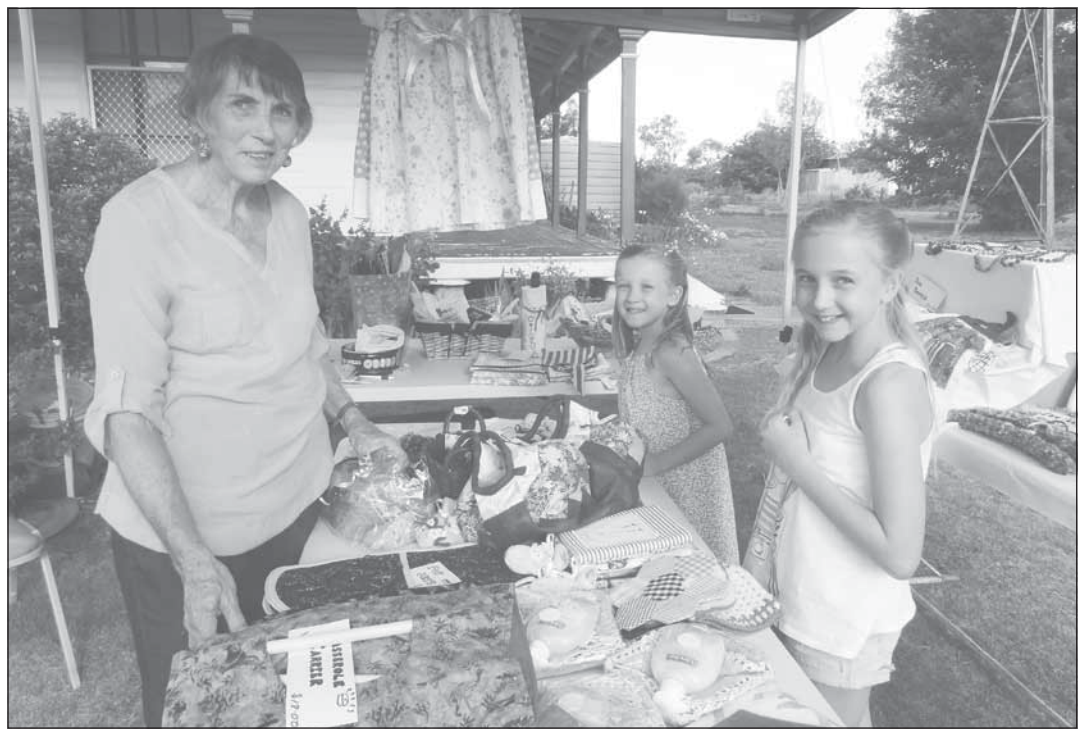
The Craft Stall at the Allora & Clifton Anglican Fete.