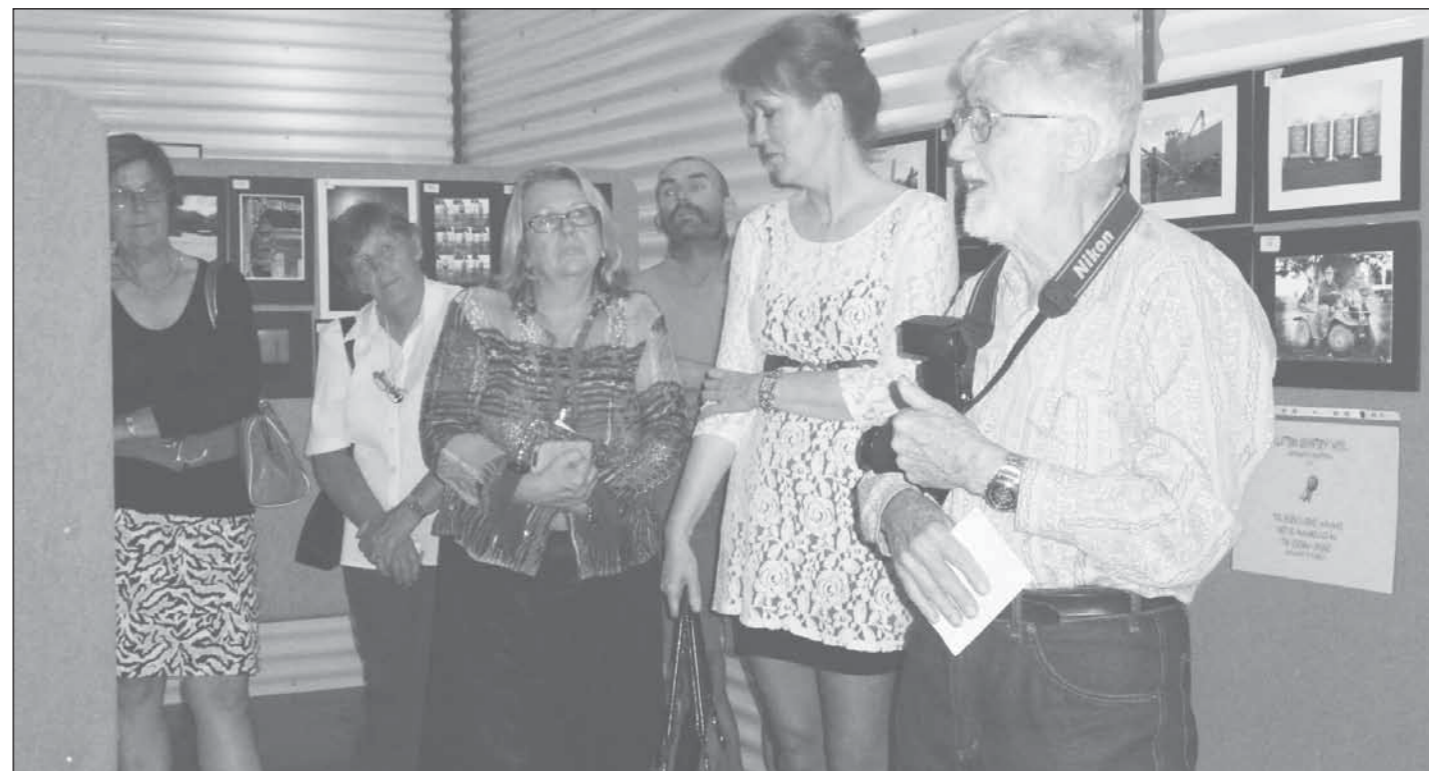
The photography competition at Clifton Country Week is always a popular event and entries so far this year are top quality.

This week of festivities is rounded off by Clifton's Annual Race Day. $10 Entry, Pensioners $5, kids under 15 are free. Competition for kids at the Jam Factory, in Clifton, give the Pinata a name. Win tickets into the races, a race book and a bag of goodies. Kids of all ages eligible, free entry. Lots of good prizes in the Fashions on the Field, buy a lucky race book and