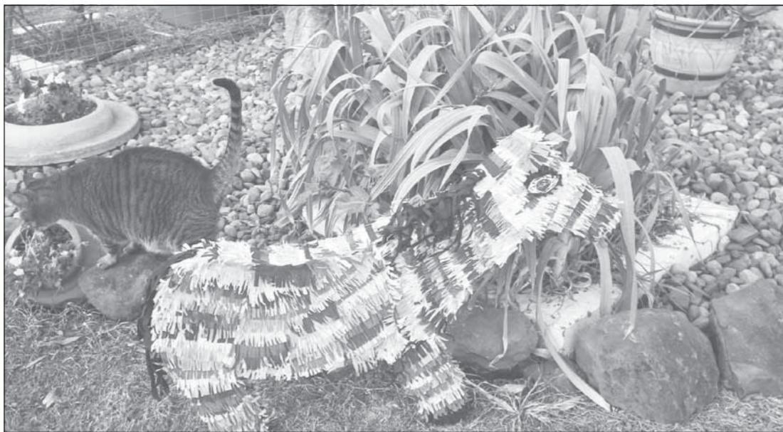
There is a prize for the kids at the Jam Factory for naming the Pinata.

For the toddlers we have a Teddy Bears Picnic on Sunday morning in Pioneer Park followed by a Decorated Bicycles and Scooters Comp. Our Butter Factory Museum has opened their doors for 25 years now and will be celebrating with rope-making,