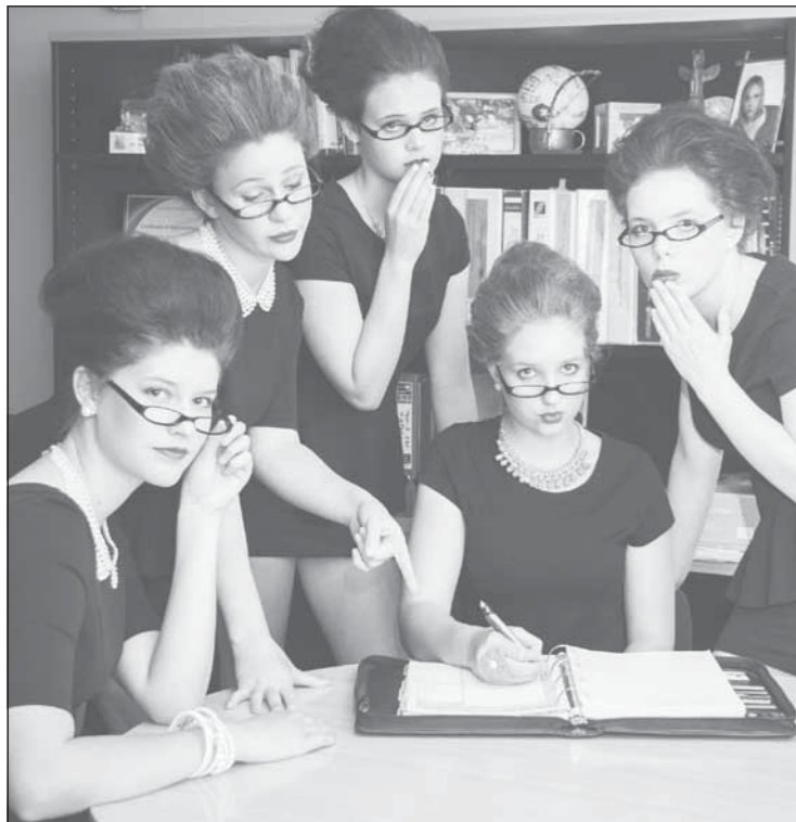
More of the 'Man of Steel' musical cast.