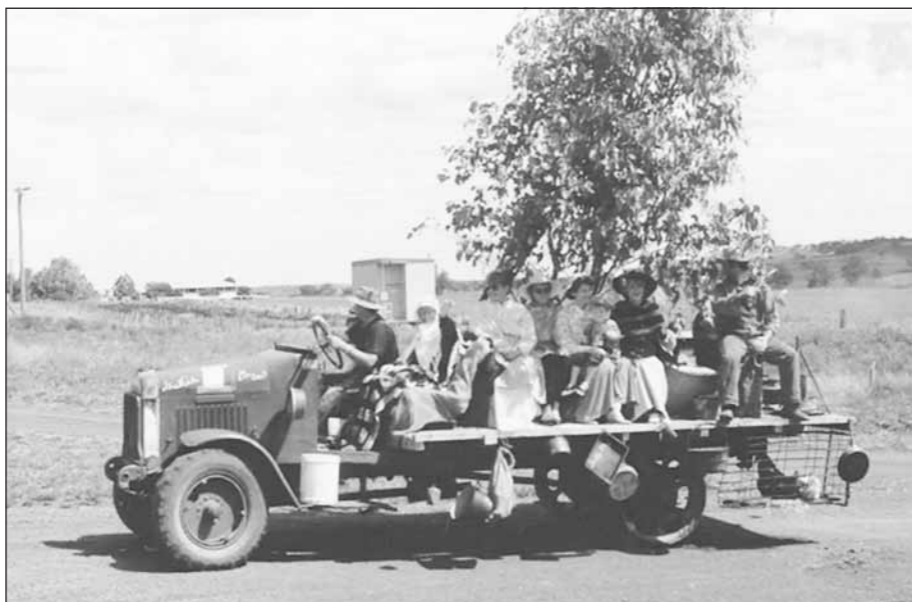
Wickham family float. Back to Goomburra Day, 17th September 1988.

To celebrate the conclusion of a successful season, the Allora Rugby League held a banquet at which a trophy