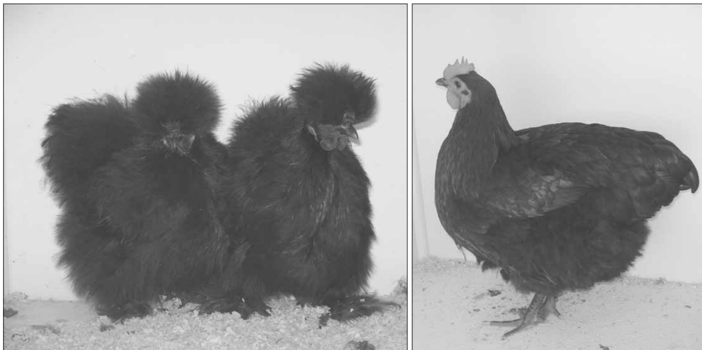
Examples of some of the more common poultry breeds available at this Sunday's Annual Spring Auction: Silkies (left) and Australorp (right)