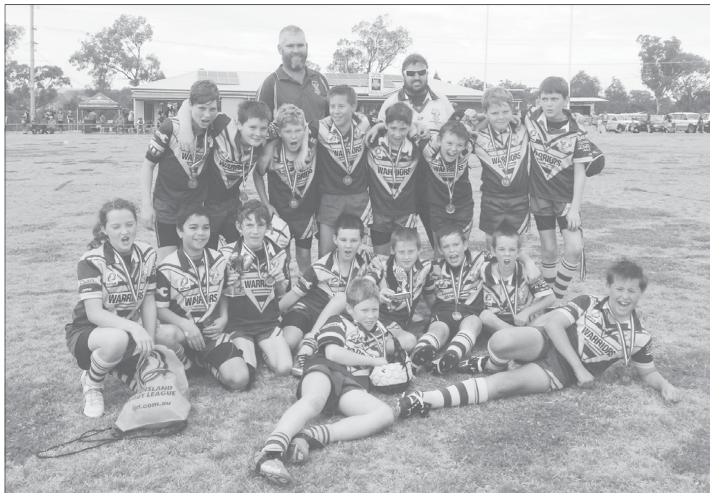
U11's Warriors 2013 runners up