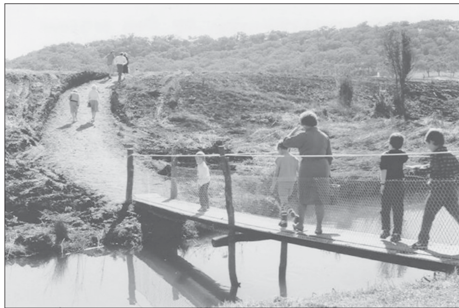
Temporary bridge over Dalrymple Creek. "Back to Allora" Day 1988.