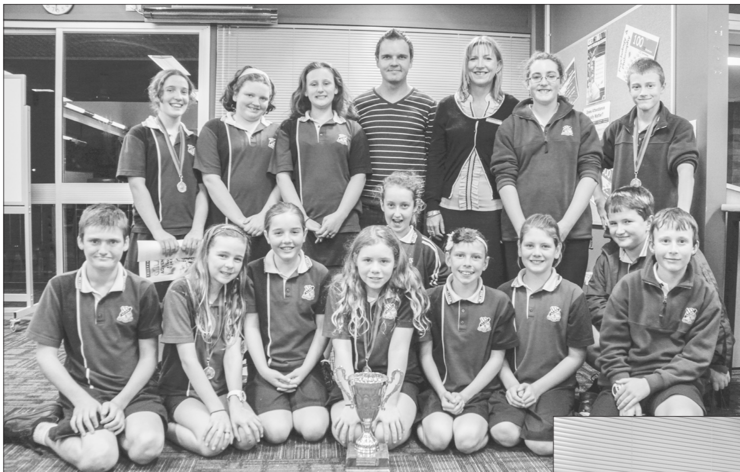
Australians" by Ethel Turner; "The Horse That Bit A Bushranger" by Jackie French; "Little Elephants" by Graeme Base; and "Galactic Adventures" by Tristan Bancks. Tristan was a special

The students were required to read 4 books: "The Seven Little