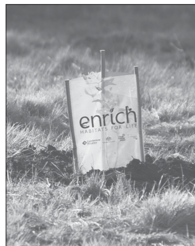
First planting at Emu Vale

Landholders in the Allora district are invited to the birthday morning tea to learn how Enrich participants have received assistance to increase biodiversity and improve