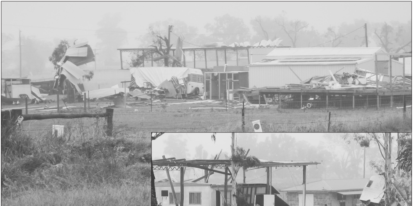
ABOVE & RIGHT: Property damage and downed trees in Pratten after severe storms.