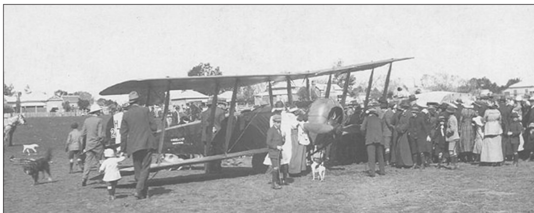
Aeroplane which crash landed on the flat near the western end of Jubb Street in 1918 (Note propeller).

An incident that could have had serious consequences was acted out in Allora and Warwick on Tuesday night. A two-seater Gipsy Moth aeroplane had left Grafton, N. S. W. earlier in the day for Warwick. Due to navigational errors the plane ended up over Ipswich. By the