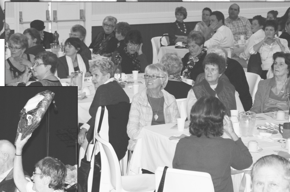
ABOVE: A good sized crowd packed the Allora Community Hall for Scope's Afternoon Tea function.