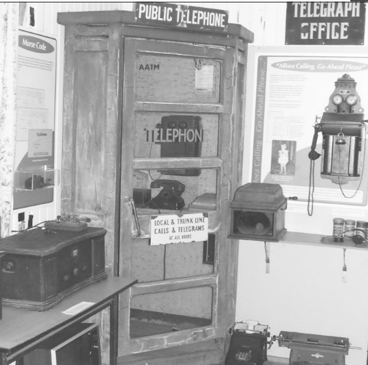
Part of the historic communications display that can be seen at this Saturday's "Display & Demonstration day" at the old Allora Shire Hall.