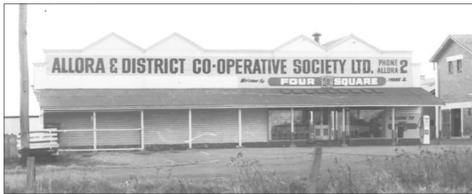
The Allora Co-op Store in 1972.