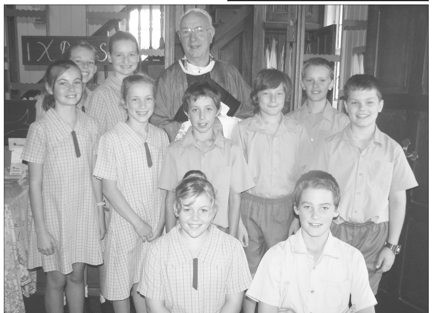
St Patrick's School inducted their Year Seven students as School leaders at Mass on Tuesday of last week. The celebration also welcomed 16 new Prep students and 7 new students in other classes and their families to the school community.