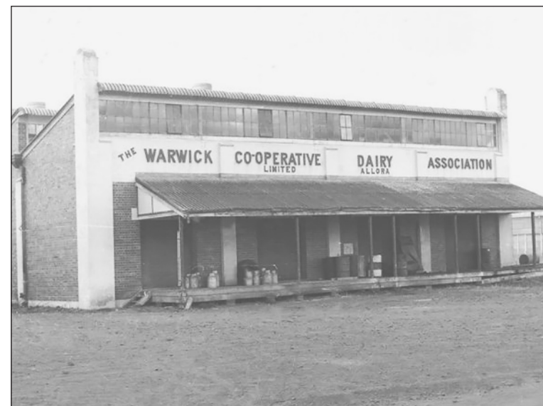
The butter factory in Allora circa 1972

The architects for the new building planned to use solid timber for the foundations owing to the treacherous nature of the black soil on which the new factory was to be built. Above the timber - ironbark logs, 14 inches in diameter - would be embedded in concrete, steel rails were to be used. The contractors, Messrs. E J and W J Grainger obtained the ironbark from a distance of 40 miles. A water cooling tower with a ground measurement of