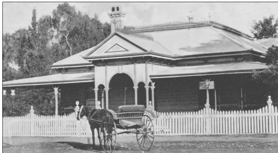
Queensland National Bank, Drayton Street, Allora, circa 1905.