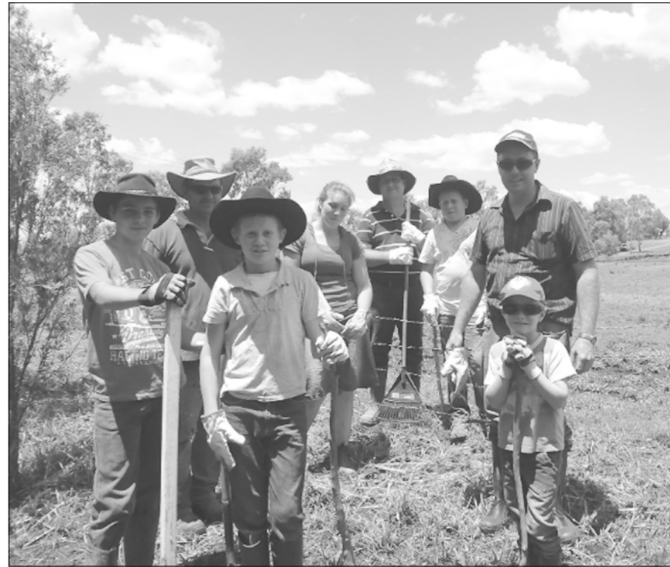
RIGHT: Community volunteers during the cleanup last weekend.

Memories from the 2010/2011 floods resurfaced when a team of 'weekend warriors' donned their cleanup gear and got together last weekend to assist with the post flood cleanups. As the cleanup process continues around the region, community volunteers assisted householders in East Warwick cleaning grass and debris from their paddock fences. The work was quite extensive and essential as fences can become permanently damaged if the debris is not cleared. The householders were very appreciative of the assistance provided. Volunteers are still need to help with various flood cleanup jobs as they come up. If you would like to assist or require further information, please call Bette Bonney, Volunteer Coordinator on 0459 098 612.