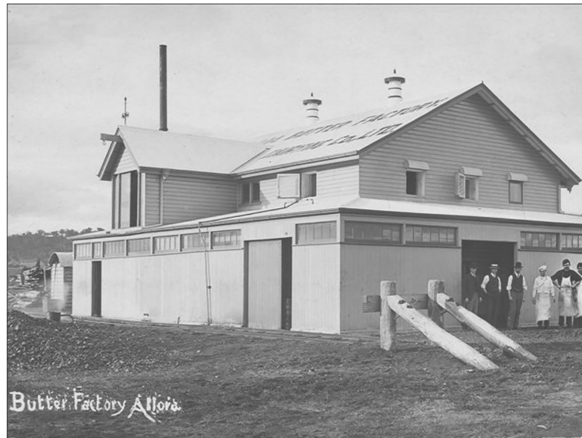
Butter Factory Allora

The Allora Guardian printed a three column story on the "Thoroughly Up To-Date Factory". A comprehensive description of every aspect of the building and operation was printed on 25th August, 1906. In October of that year there were 350 suppliers. 24,350lbs of butter was manufactured.