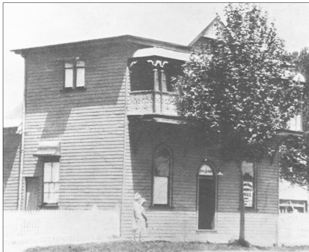
The Allora Shire Chambers in 1932 showing the original picket fence.