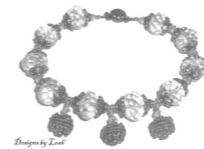
Beads of Ambrosia