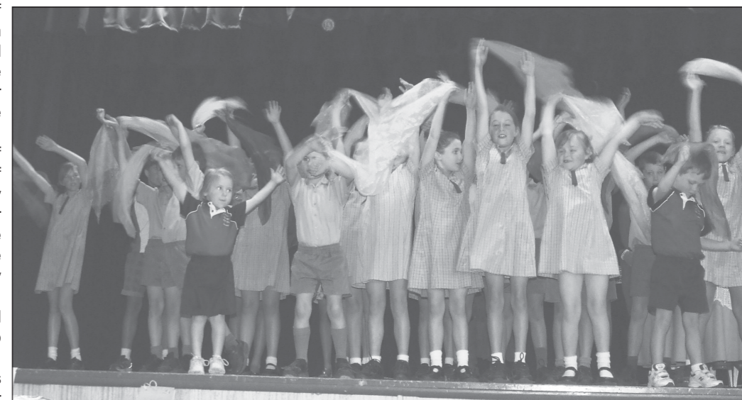
Students from St. Patrick's School Allora performing at the St. Patrick's Parish Celebrations of 96 years of the Sisters of St. Joseph in Allora.