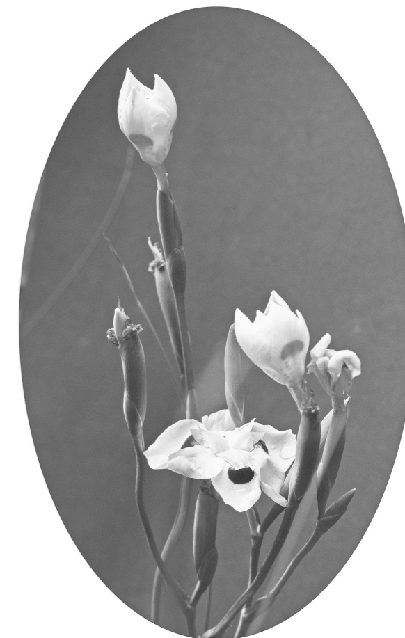
Pepperina Gallery Photo