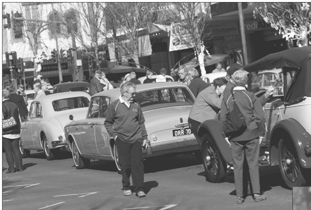
ABOVE, BELOW & RIGHT: Some of the vintage vehicles at last year's Jumpers & Jazz Rally.

"While developing the Jumpers & Jazz offering, we are creating awareness of Warwick's ties to motorsport and in particular helping to build Warwick's reputation as the 'Horsepower