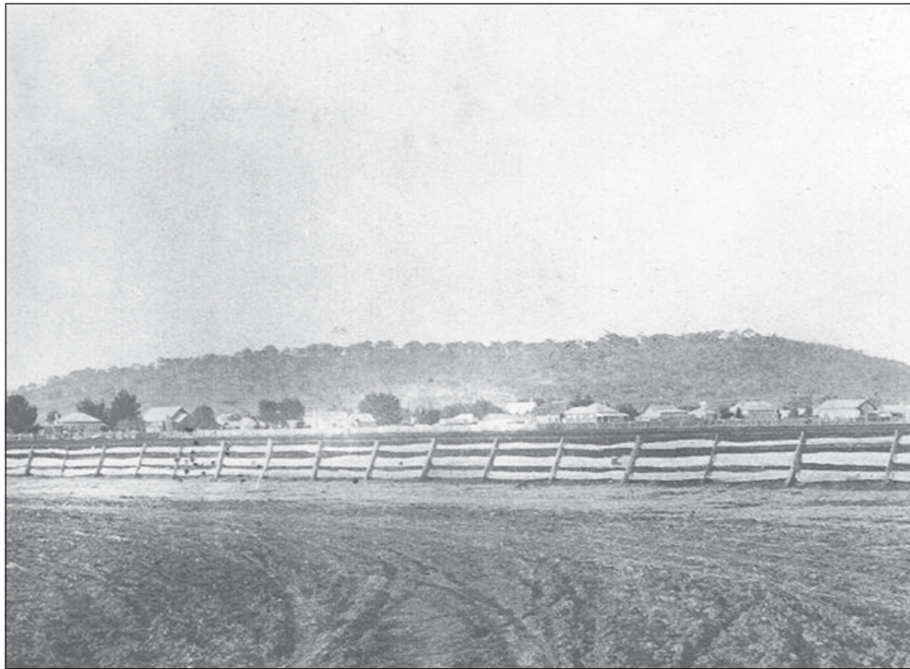
A photo of Allora taken from the south west in the 1890's.