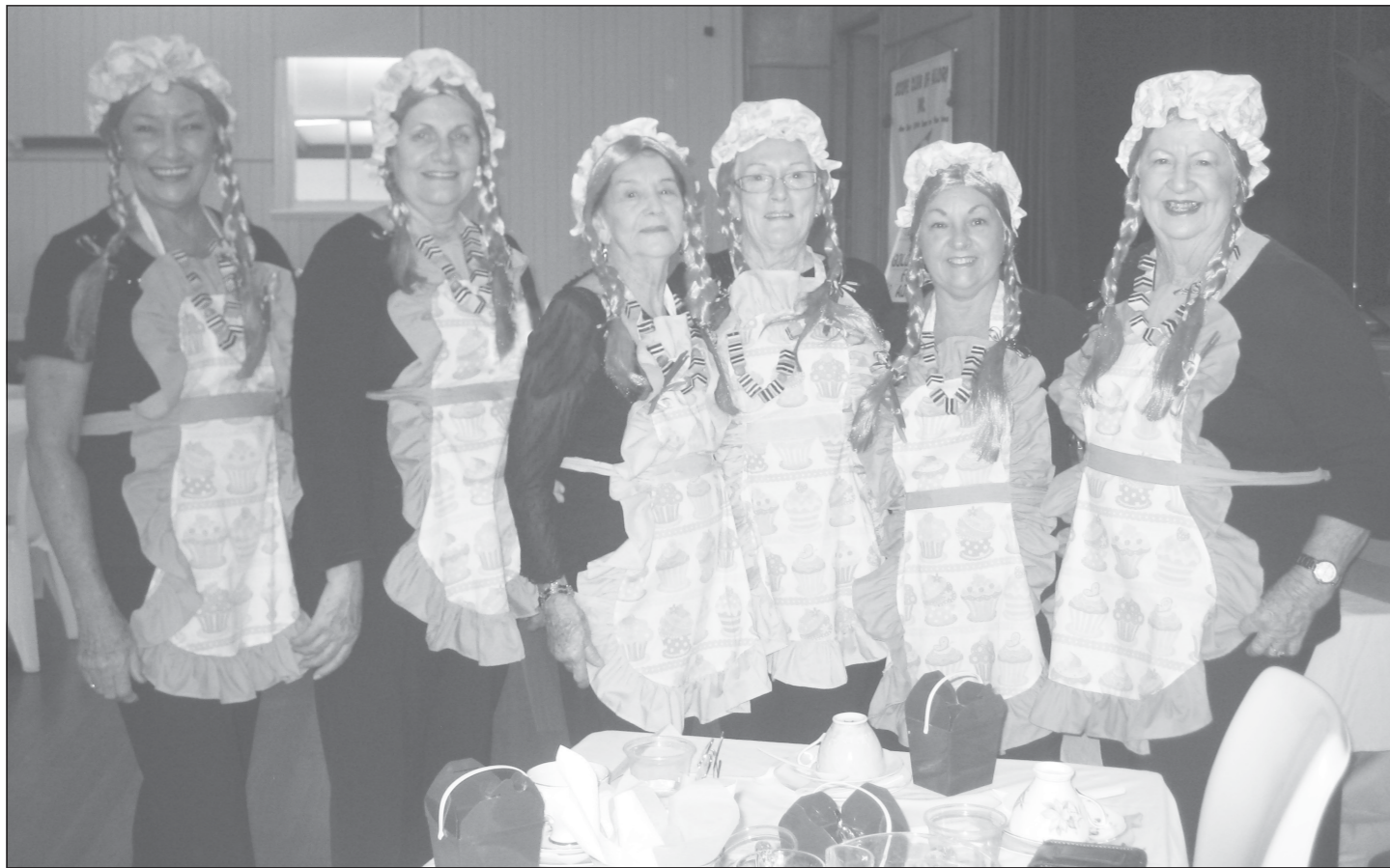
Scope Club members from Balina attended the Annual Scope Afternoon Tea in Allora on April 21.