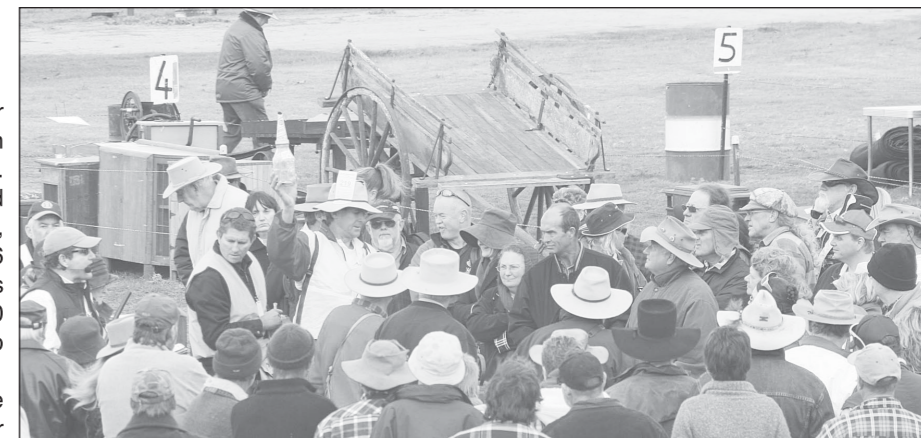
The crowd at last year's Community Auction.

Since its beginning as a White Elephant Sale organised by Apex members to raise funds for the Allora community, the auction has evolved into a sale of massive proportions. In 2008 the few remaining Apexians handed the reins over to the Allora Show Society, guiding them all the way. Items are sold on commission if not donated and the profits are shared between the Show Society & all the organisations volunteering their services throughout the weekend. Last year 27 local organisations received funds. Approximately 200 volunteers assist over the 3 days. The showground is amassed with items for sale on Saturday & Sunday, ready for auction on Monday. Twelve auctioneers, working 3 at a time, share their workload throughout the day which begins at 8.00 am sharp. Approximately 1000 bidders try their luck to snare the bargains.