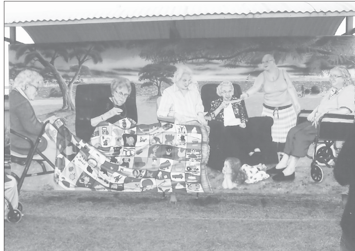
The finished mural on display for the tourists to view in Sheffield.

"Every jury is a little parliament".) In each case, the jury reached a verdict which showed that the colonial legal system was capable of delivering a just – if sometimes terrible decision. Tonight's episode is Massacre At Myall Creek . In Sydney in December 1838, seven men stand accused of the mass killing of a group of unarmed Aborigines. The massacre of about 30 Wirrayaraay people at Myall Creek was the culmination of a series of conflicts between settlers and Aborigines in the Liverpool Plains region of NSW. The men responsible for the massacre included freed and assigned convicts who had spent a day unsuccessfully pursuing a group of Aborigines. When they came to Henry Dangar's (played by Paul Denny) Myall Creek Station, they discovered a group of Wirrayaraay who they rounded up and tied together. The Aborigines were then led off and massacred. Two days later, the men responsible for the massacre returned to the scene of the crime to burn the bodies.