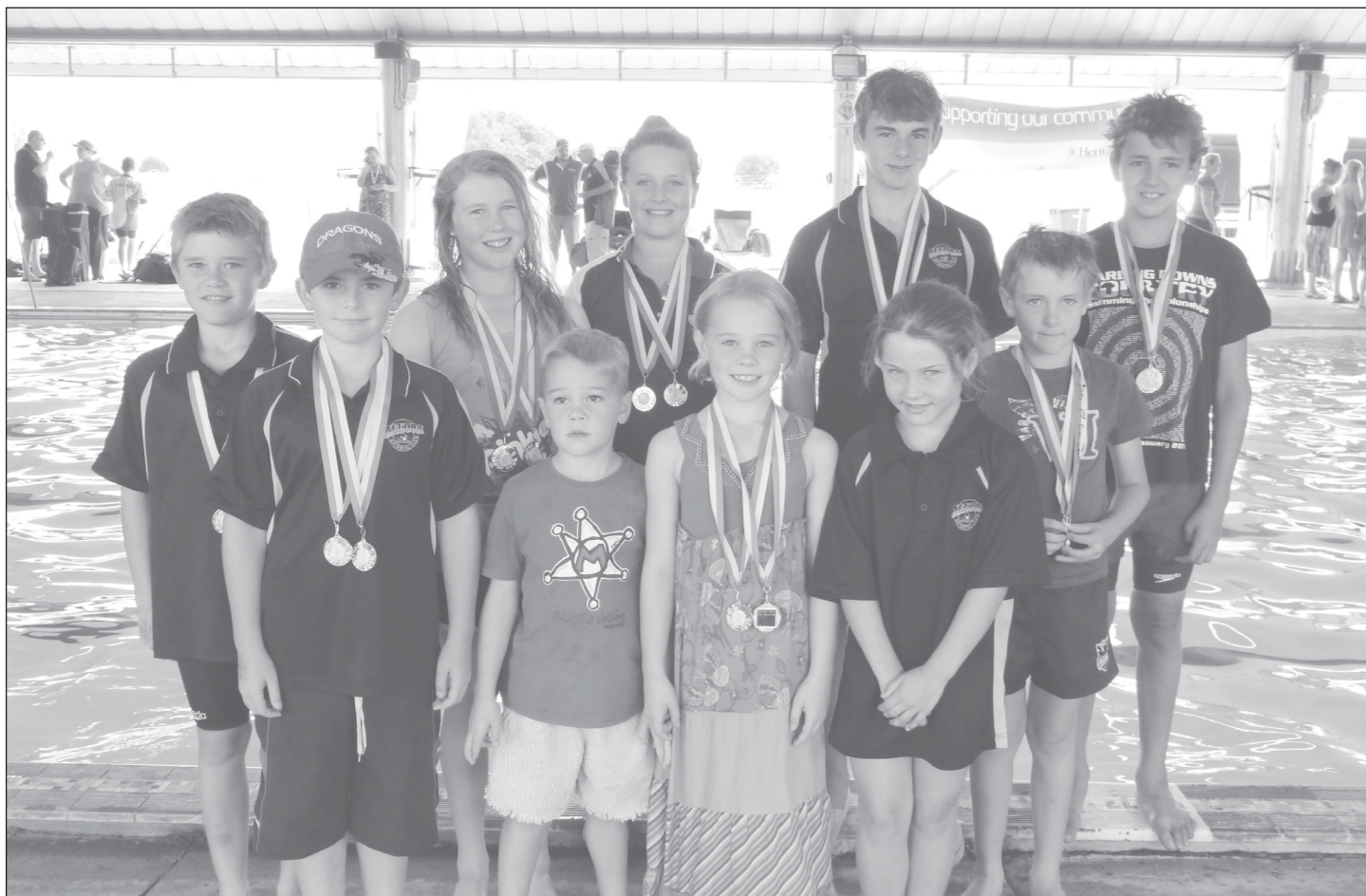
ABOVE: Members of the Allora Swimming Club who competed at the Clifton Swimming Carnival on Sunday, 11th March. The team all swam very well and everyone who was old enough to qualify for medals came home with at least one. For a couple of the kids it was the first carnival they had done.

Barron Street, Hendon, M/S 765, Allora. Phone 4666 3502 For all your Steel Requirements. Call in and get a quote on your next job. For Pipe, Panels, Posts and Gutter and Barge for the shed, we have it all in stock.