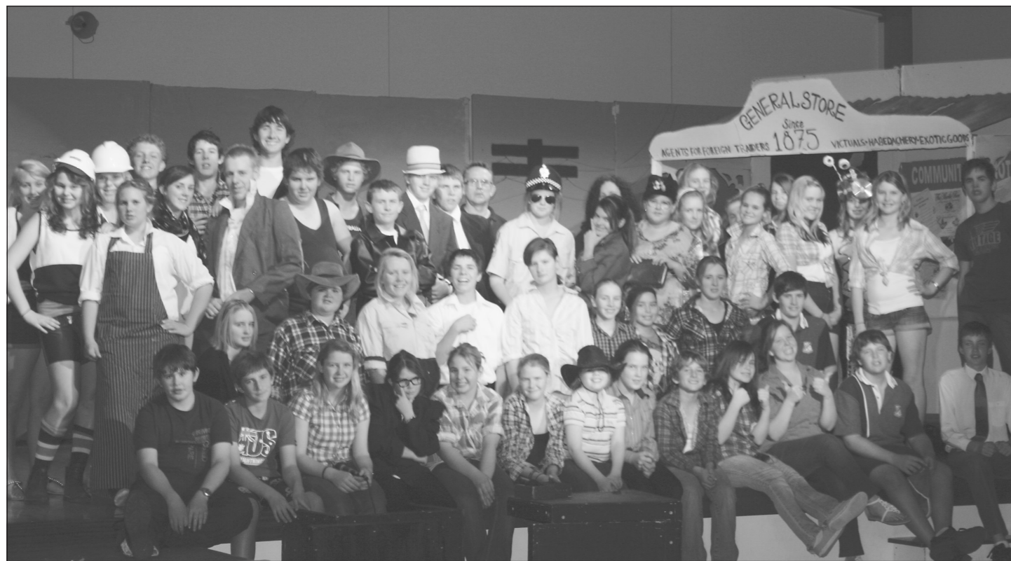
The full cast of Allora State School's successful Min Min musical production.