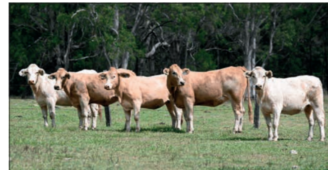
Cattle fitted with CERES TAGs.

"You can also share that data with other stakeholders like the bank or an insurance company as evidence of go of animal welfare."