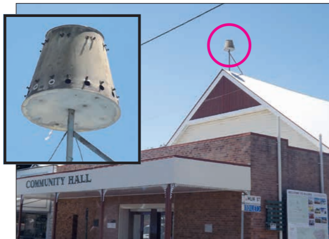
Allora's Community Hall with close-up of its mystery bucket.

An interested reader contacted the Allora Advertiser to find out what the "upside down bucket on top of our Community hall?" represents. (The reader suggested it was a Sputnik from Russia). Does anyone in readership-land have the answer and is there any historical significance? Please send us an email to - editor@advertiser.com - then everyone will know.