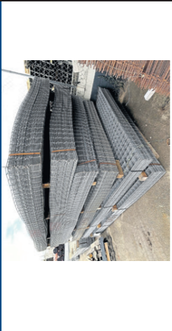
• 100 X 100 X 5.6MM EA $85 ea • 4200 X 2.4M -