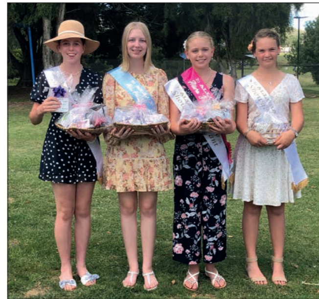
Entrants in the 2021 Allora Showgirl Competition.

After a break of 5 years the Allora Show Society has decided to bring back these popular competitions which still run in many local shows in the district.