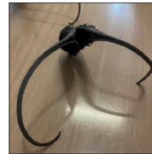
A dried out seed pod.

It is Devils Claw - see picture below of dried out seed pods which can be spread by livestock. The long parts of the pods attach to the legs of livestock until the seeds eventually fall off and spread. (These dried seed pods are not from Mary Poppins House.)