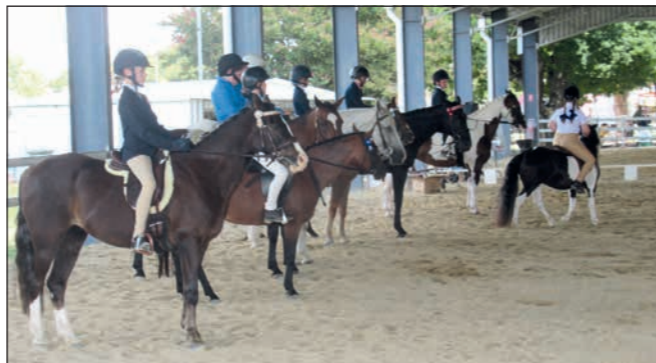
Young riders line up for their event under the "big top".