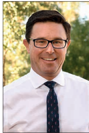
David Littleproud MP.

For further information, visit GrantConnect to view this: www.grants.gov.au/Fo/Show?FoUId=5dfb2962-c6ac-4d8b-995d-5de87cfb24f3 or scan QR code at right.