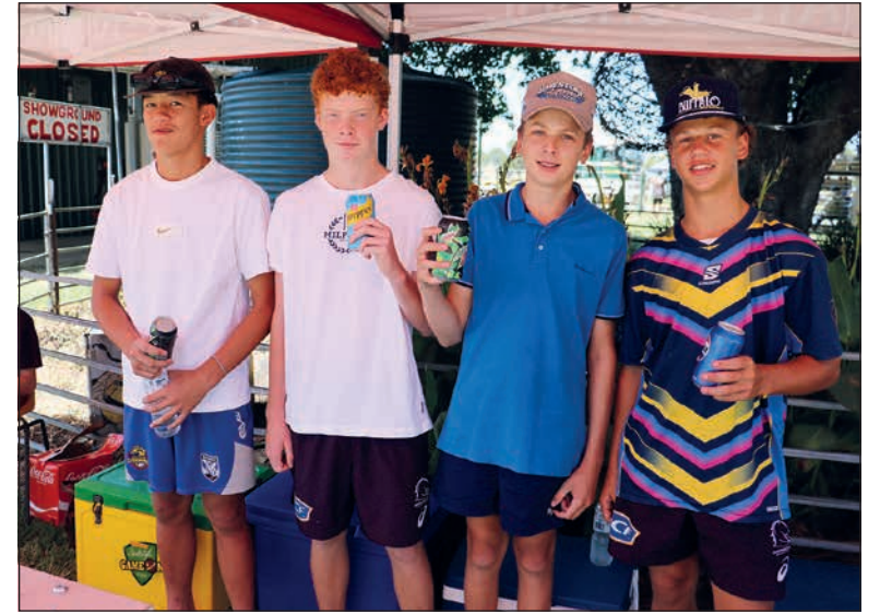
Students from Allora P-10 selling drinks.