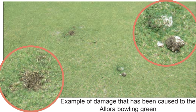
Example of damage that has been caused to the Allora bowling green

Due to the damage caused by corellas picking at the green juicy grass of the bowling green, Allora's night bowls have been put back a week. Peter Mole is the Club's greenkeeper and