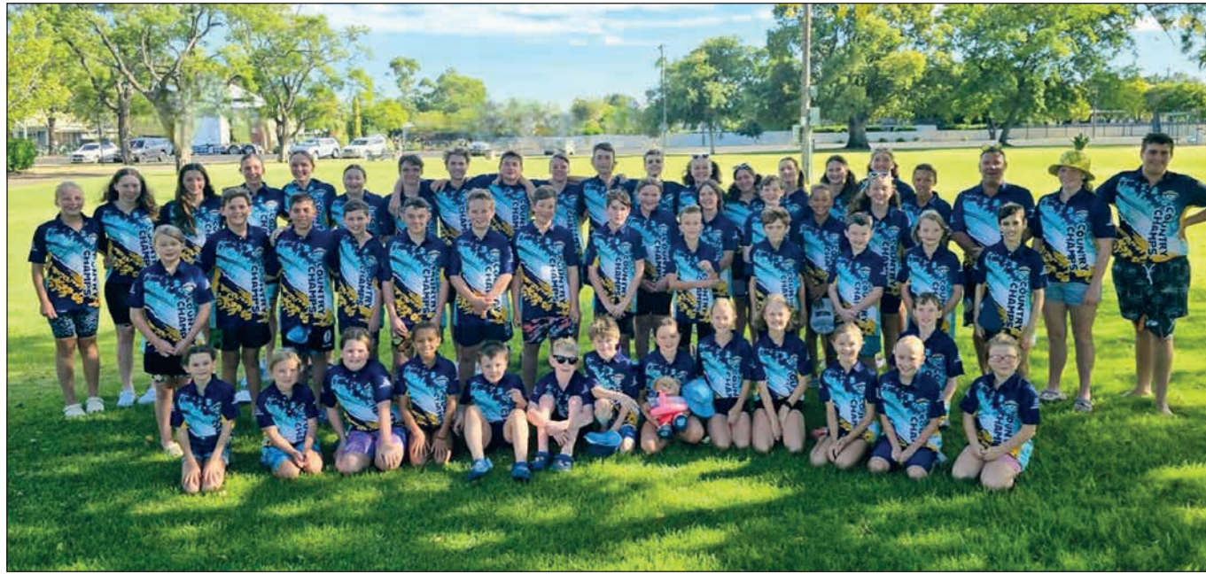
Allora Swim Team group photo.