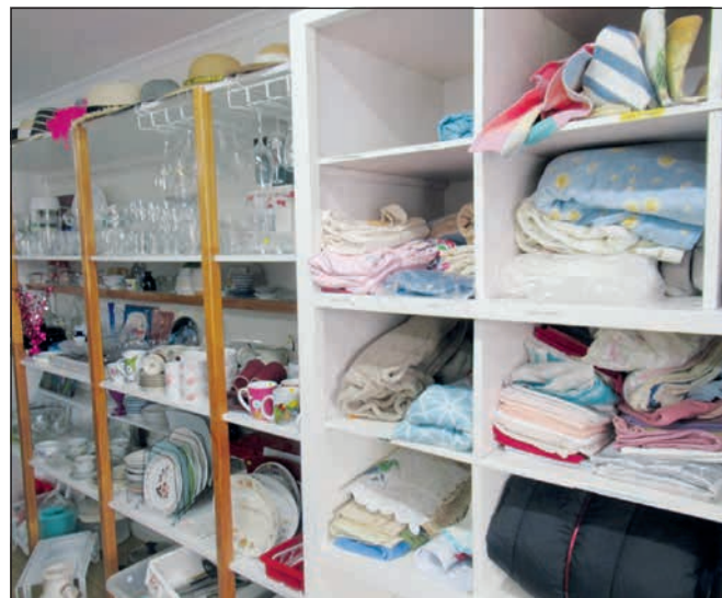
Allora Scope Community Op Shop.

Both Shops have adjacent bins where donors can deposit good clean items for resale.