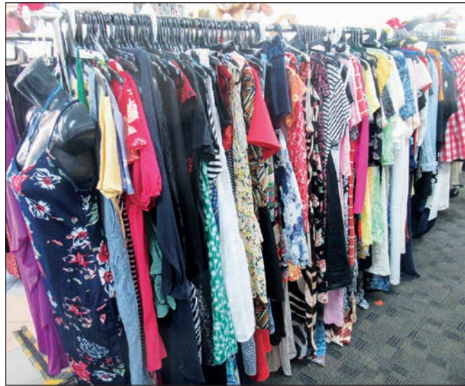
Allora Salvation Army Family Store.