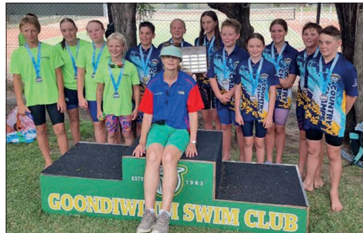
Junior Relay Teams.