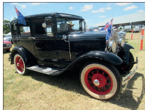
1930 A Ford.