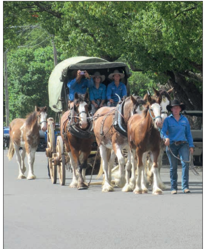
Darling Downs Heavy Horse Event