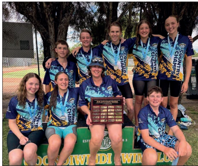
Senior Relay Team.

Fifty-two members of the Allora Swim Club travelled to Goondiwindi on Saturday 18TH January for the Darling Downs Regional Swimming Association Country Championships